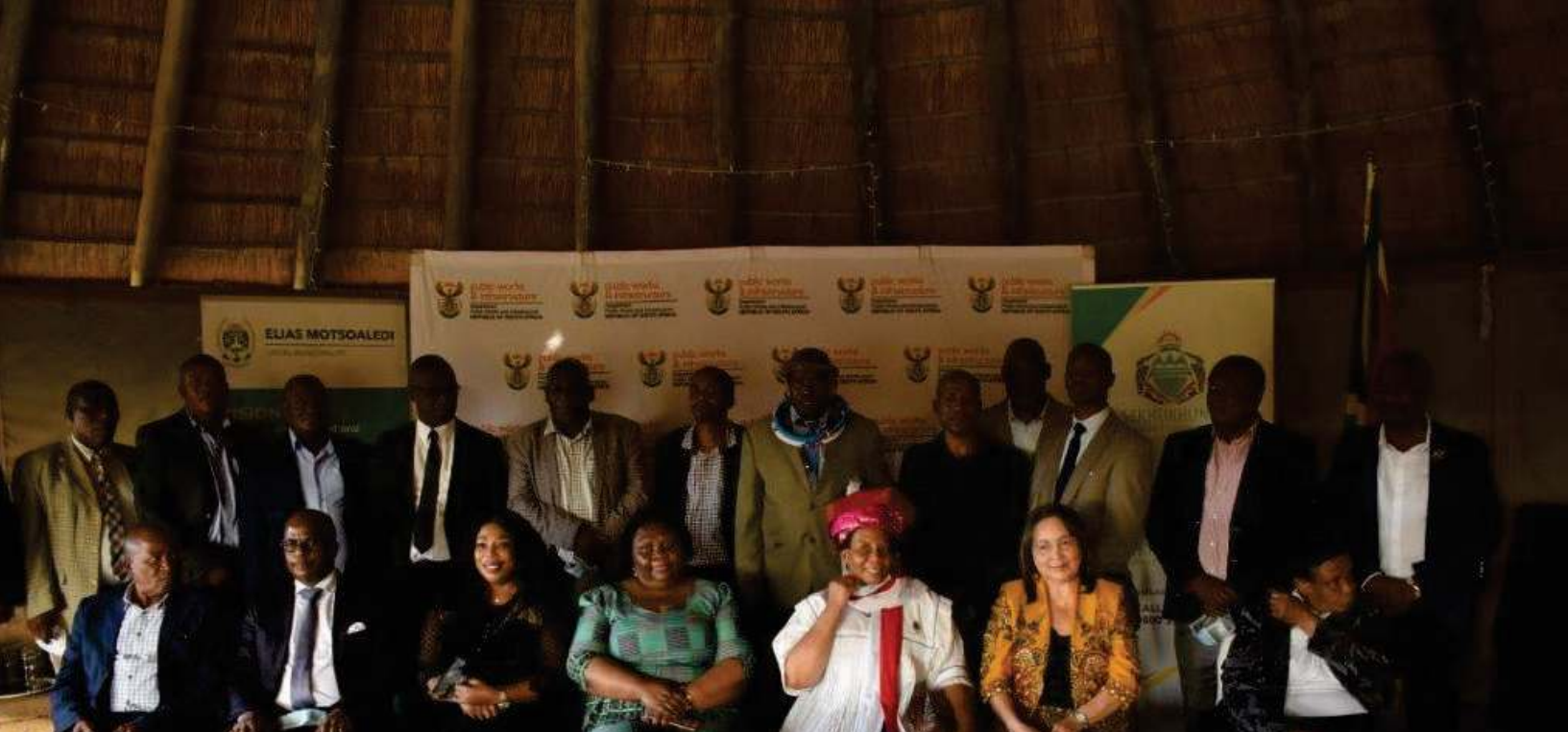
Friday, 21 May 2021 - A day before the handover of land and title deeds to farmers in Tafelkop, DPWI officials joined Minister Patricia De Lille and Deputy Minister Noxolo Kiviet to meet the local traditional leadership in Groblersdal under the Sekhukhune District Municipality in Limpopo