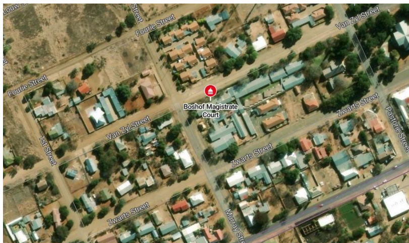
Figure 1: Boshof Magistrates Court

C3.2.2.3 Project Cost Estimate The project cost estimate is R5 543 381,00 including VAT and Electrical work is estimated at R2 217 352,40 including VAT