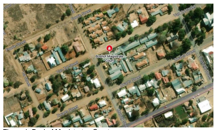
Figure 1: Boshof Magistrates Court