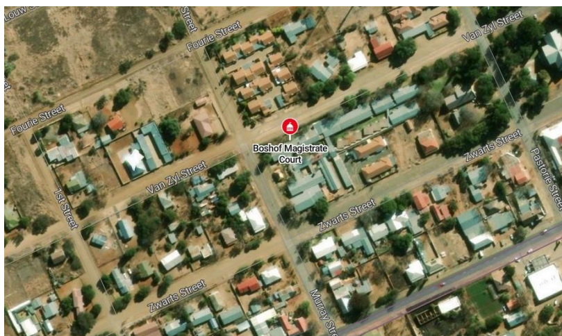
Figure 1: Boshof Magistrates Court