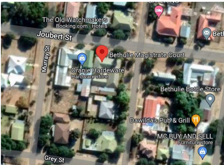
Figure 1: Bethulie Magistrate Court

The project cost estimate is R3 514 188.26 and structural / civil works is estimated at R1 054 256.48 including VAT.