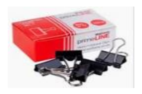
FOLDBACK CLIPS MEDUIM 32mm