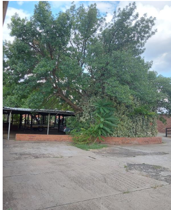
Pune ±10 trees (trees must be neatly pruned and balance, ensuring 1m roof/fence clearance)