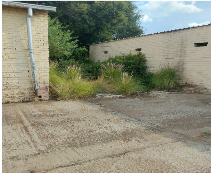
Clean yard and remove all rubble on site