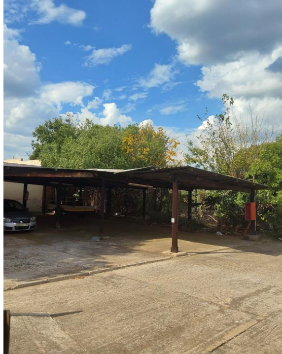
Cut down ±3 trees damaging the fence