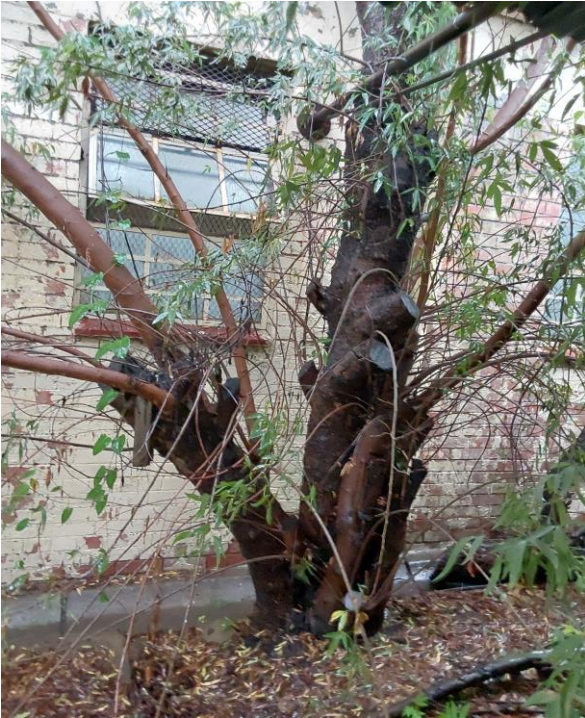
Cut Rhus sp to soil level & treat with herbicide