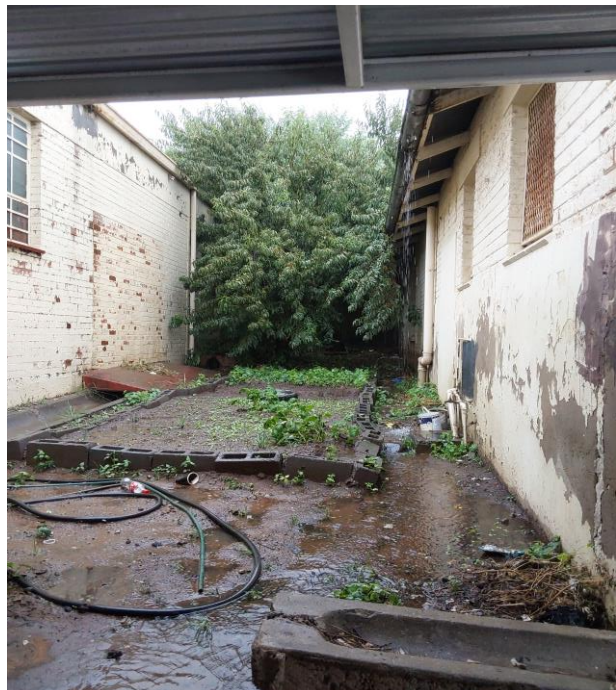
Prune tree, clean up passage and remove rubble