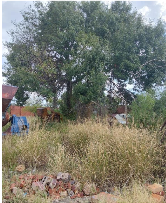
Pune ±10 trees (trees must be neatly pruned and balance, ensuring 1m roof/fence clearance)