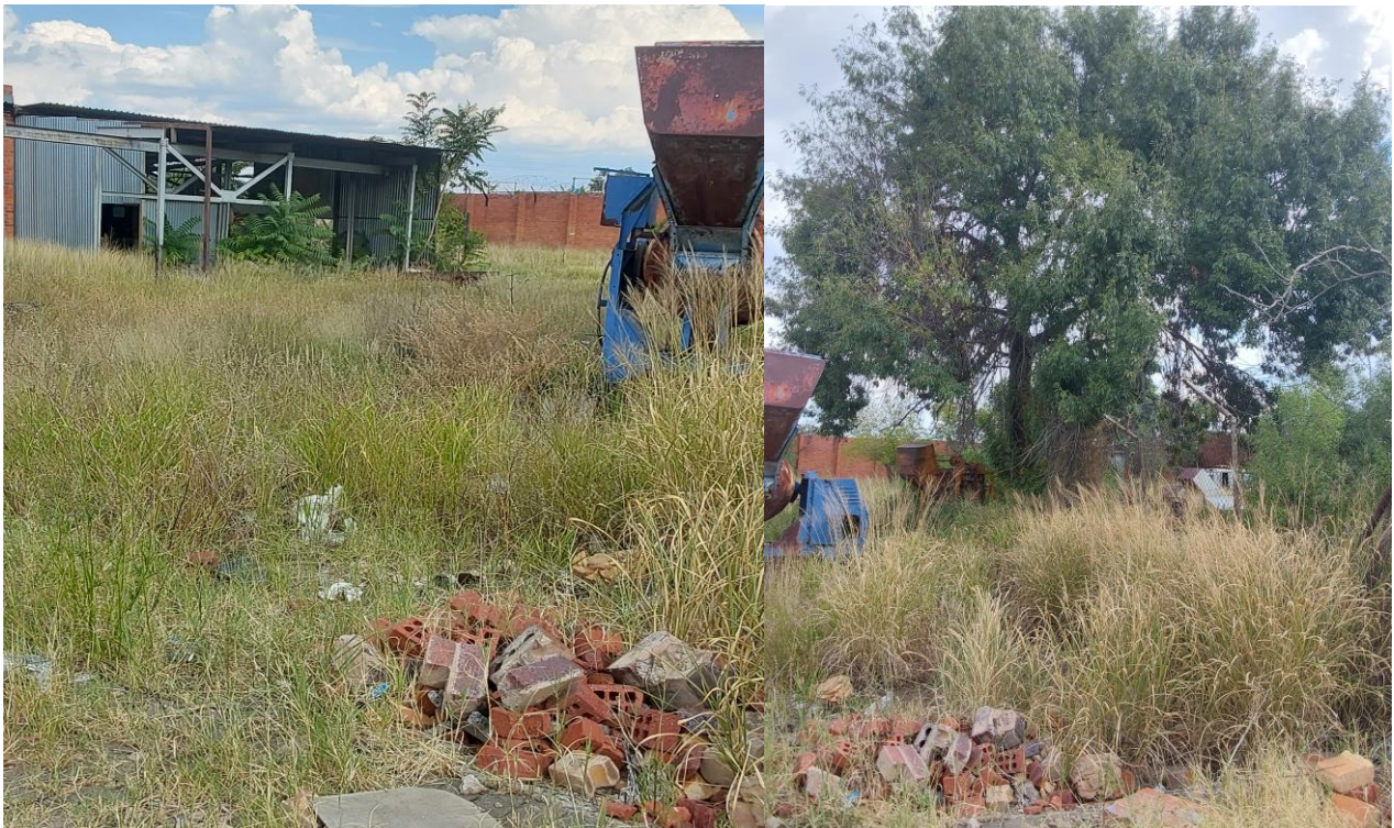
Clean the yard and remove all rubble on site.