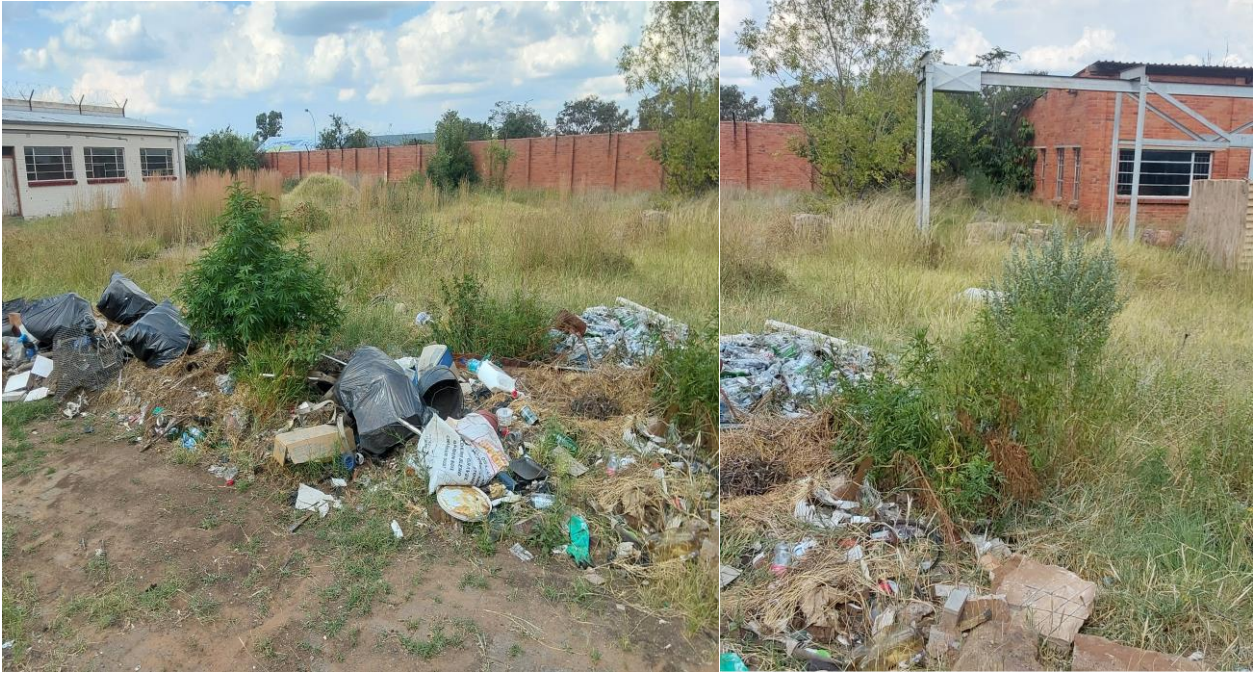
Clean the yard and remove all rubble on site.