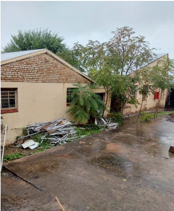
Clean yard and remove all rubble on site