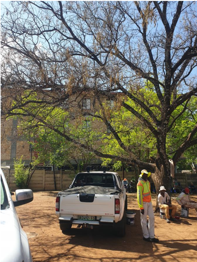
Same tree as above; remove low hanging branches