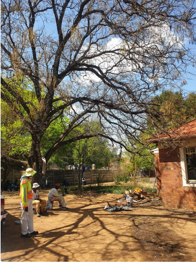
Prune tree, removing all branches resting on roof.