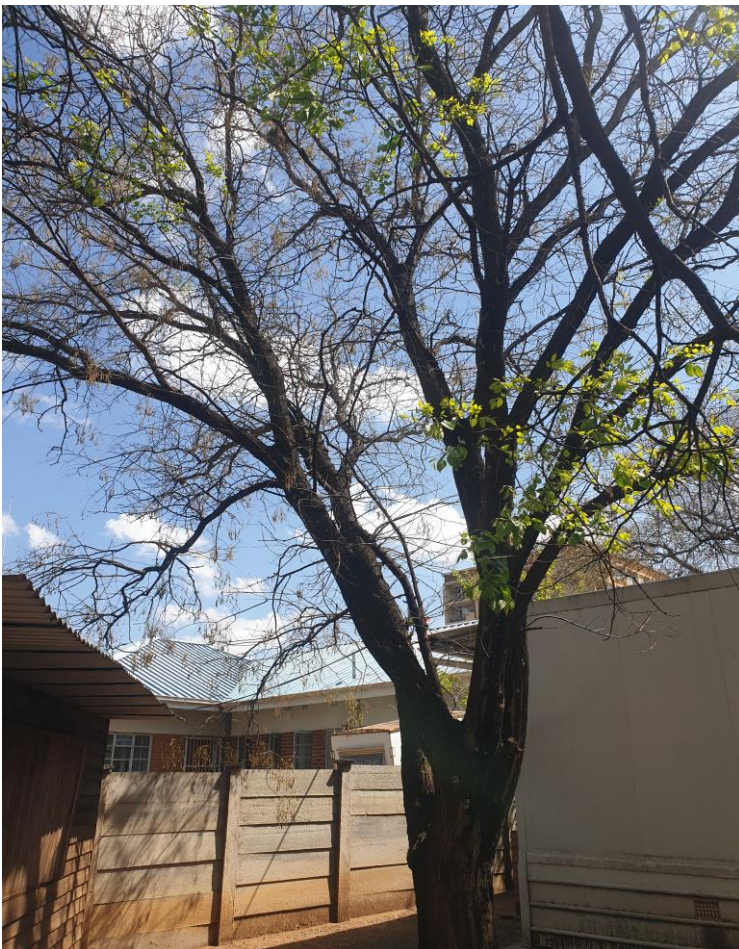
the tree as a whole.