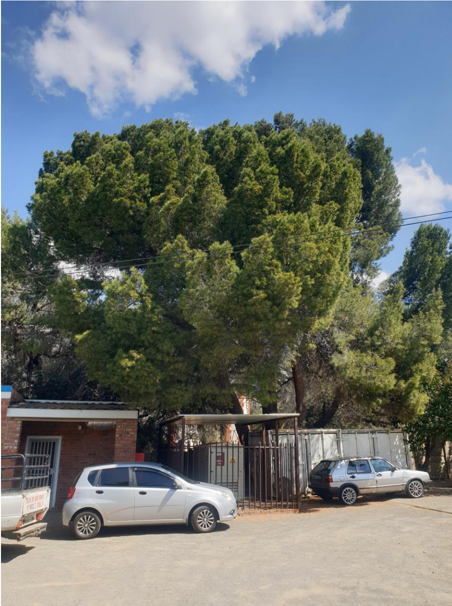
Remove all dead and low hanging branches of pine tree, ensuring a 1.5m clearance above roof level.