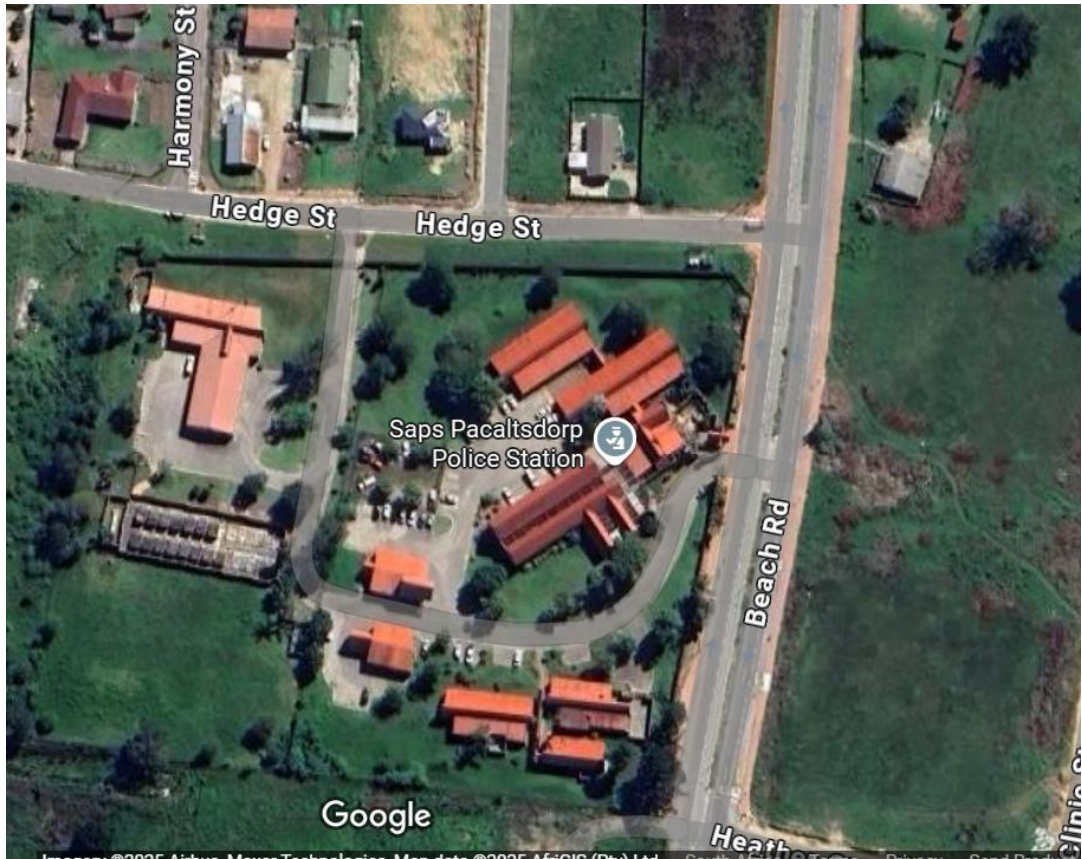
Figure 1: Satellite view of George Dog Unit