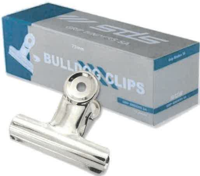
Bull dog clips