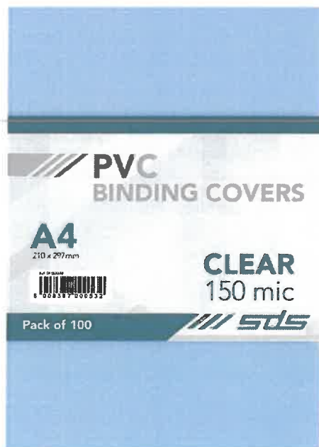
PVC binding covers clear 150 mic