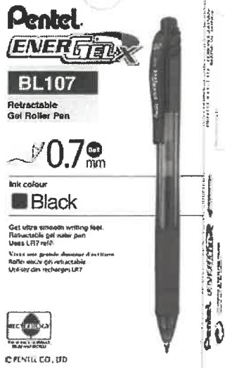
Pentel energel x retractable 0.7mm black