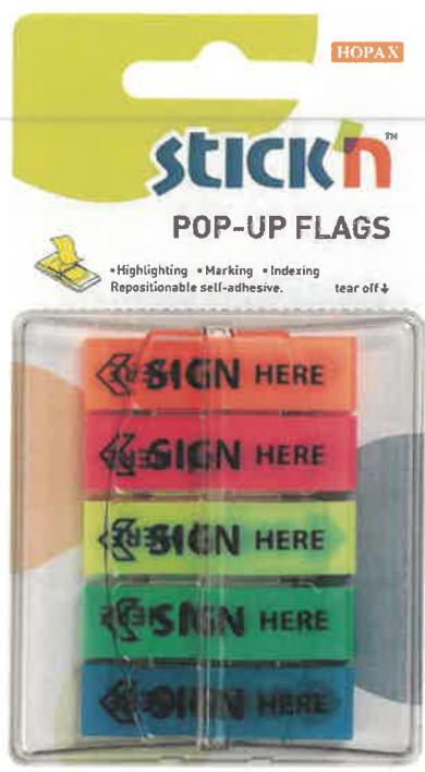
Sign here stickers