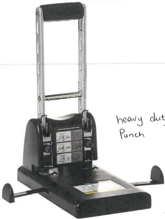
heavy duty Punch