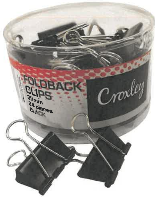
fold back clips