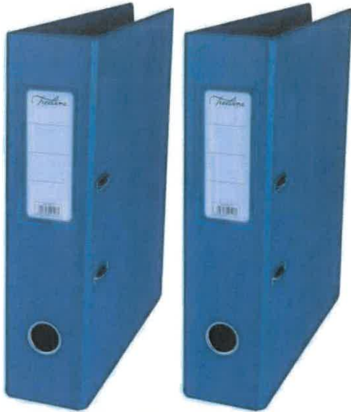
Arch lever files