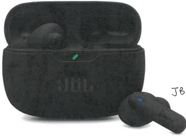
JBL TUNE 245 NC