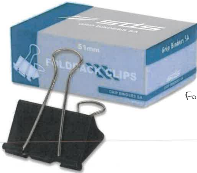
Fold back clips