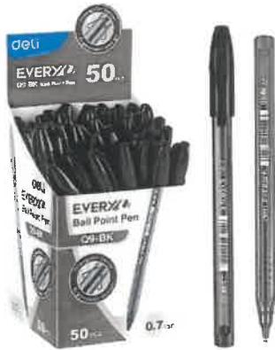
Deli Ball Point Pen (Q9) - 50pcs (Black)