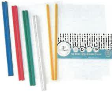
A4 Slide Triangle Grip Binder Cover