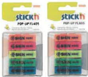
Please sign stickers