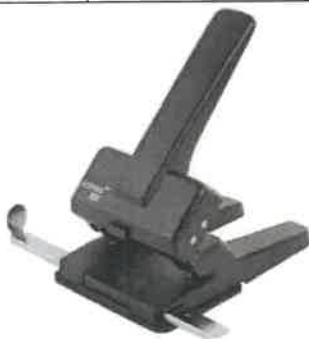
Giant 2 hole punch