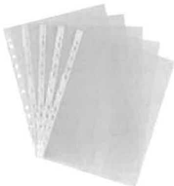
Plastic Sleeves Pocket