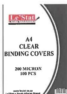
A4 Clear Binding Covers