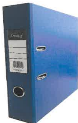
A4 Lever Arch File, Polypropylene