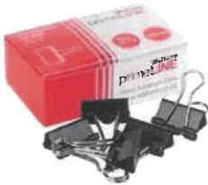
Foldback clip 32mm, 41mm, 51mm