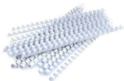
Binding Elements Plastic