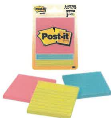
3M Post-it Notes - 6301 – Lined