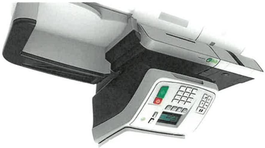
Franking Machine (IN-360 Franking Machine)