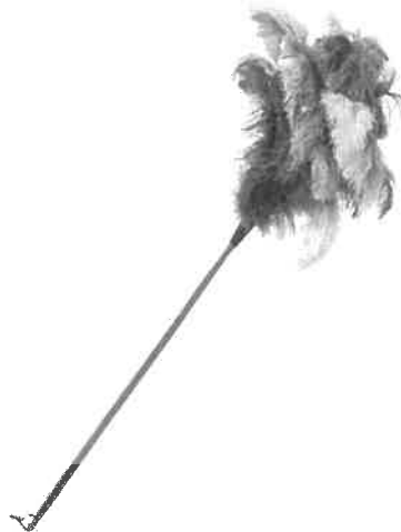
1.8M FEATHER DUSTER