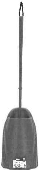
TOILET BRUSH SET