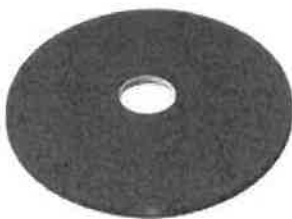
SCRUBBING FLOOR PADS (BLACK)