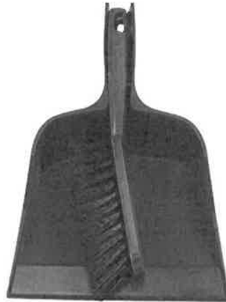
DUST PAN SET