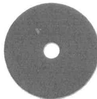
SCRUBBING FLOOR PADS (RED)