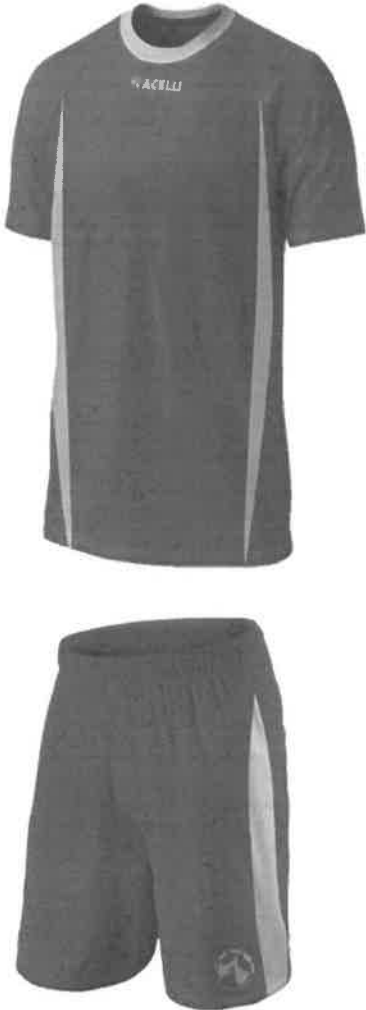
Soccer jersey and Shorts