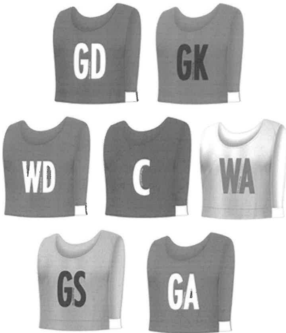
Netball Bibs, Country Club