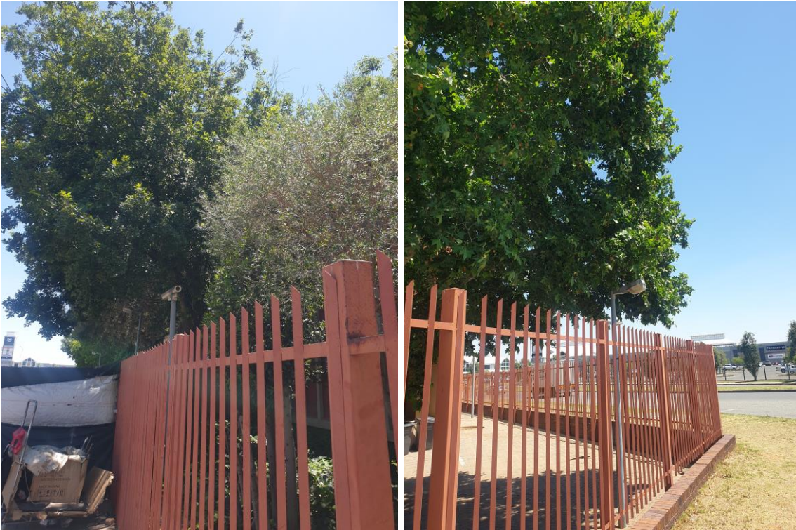
Prune branches obstructing CCTV and security lighting around premises.