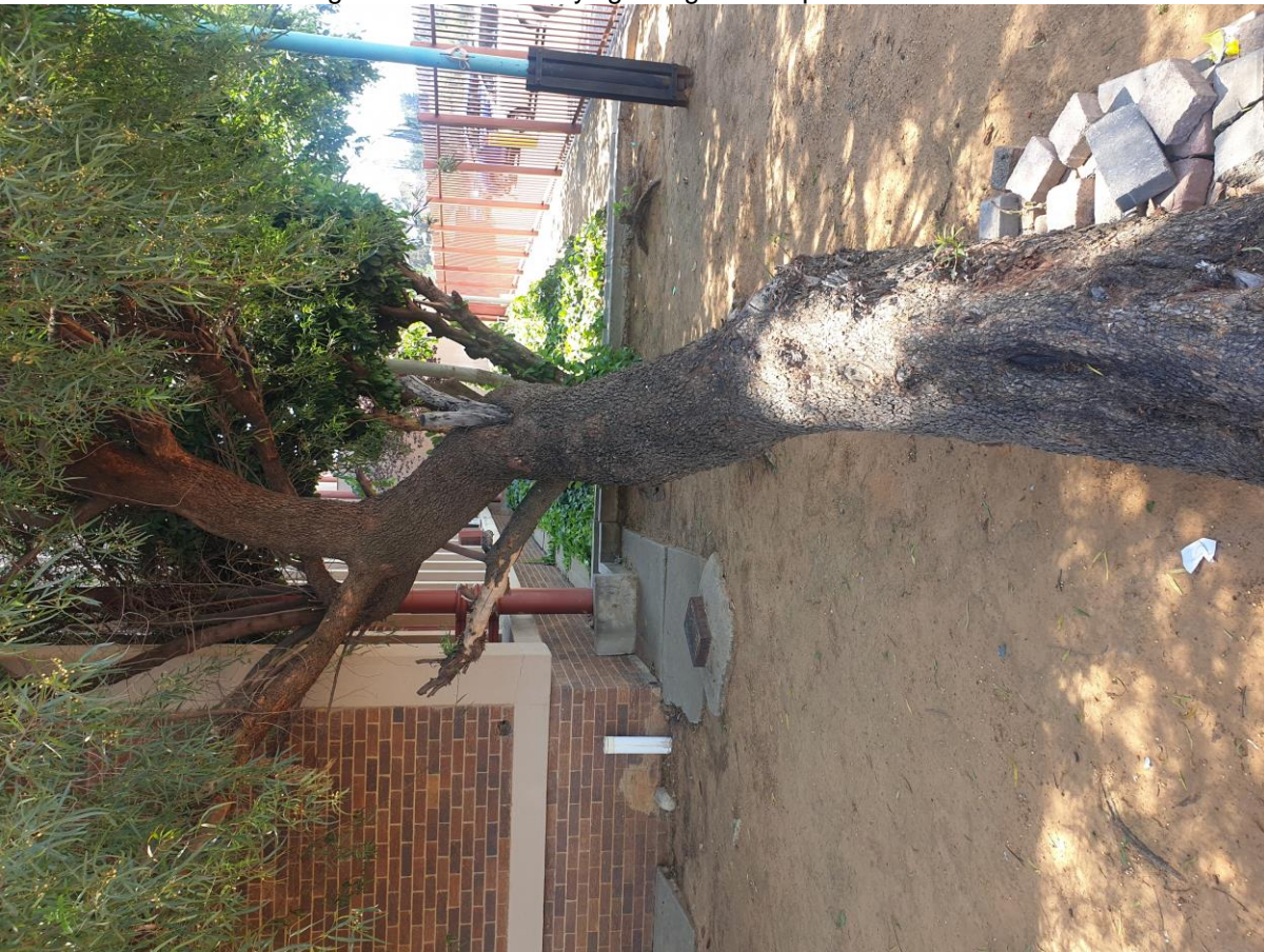
Remove Rhus, which is leaning over and resting against building.