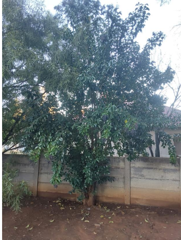
Item 2B – Remove Ligustrum