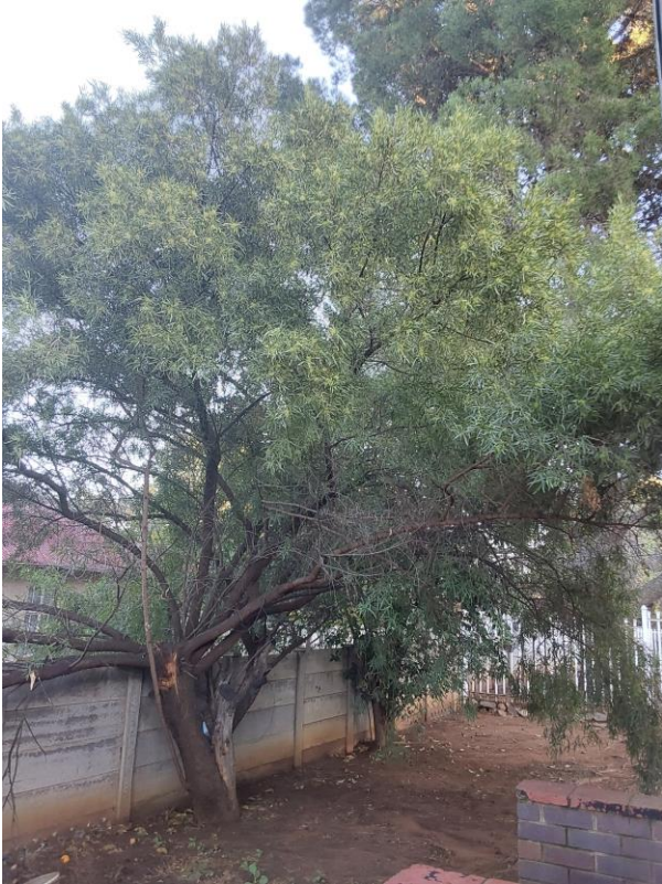
Item 2A – Remove Rhus