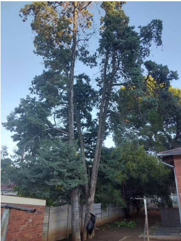
Item 1 – Remove Conifers