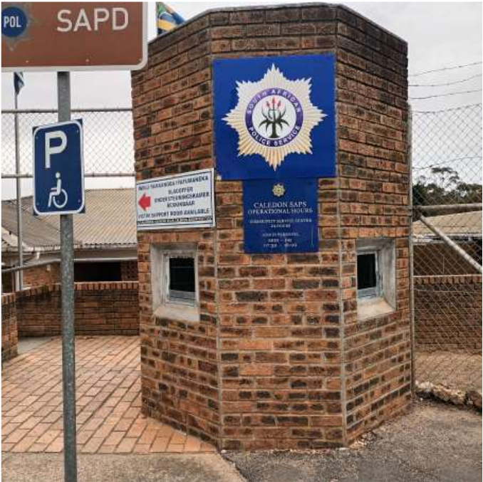
Figure 2: Front Entrance of Caledon Police Station