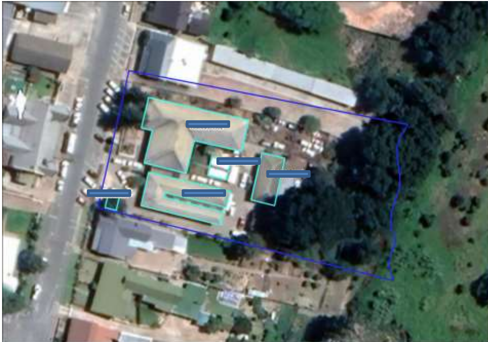
FIGURE 1: AERIAL VIEW OF CALEDON POLICE STATION