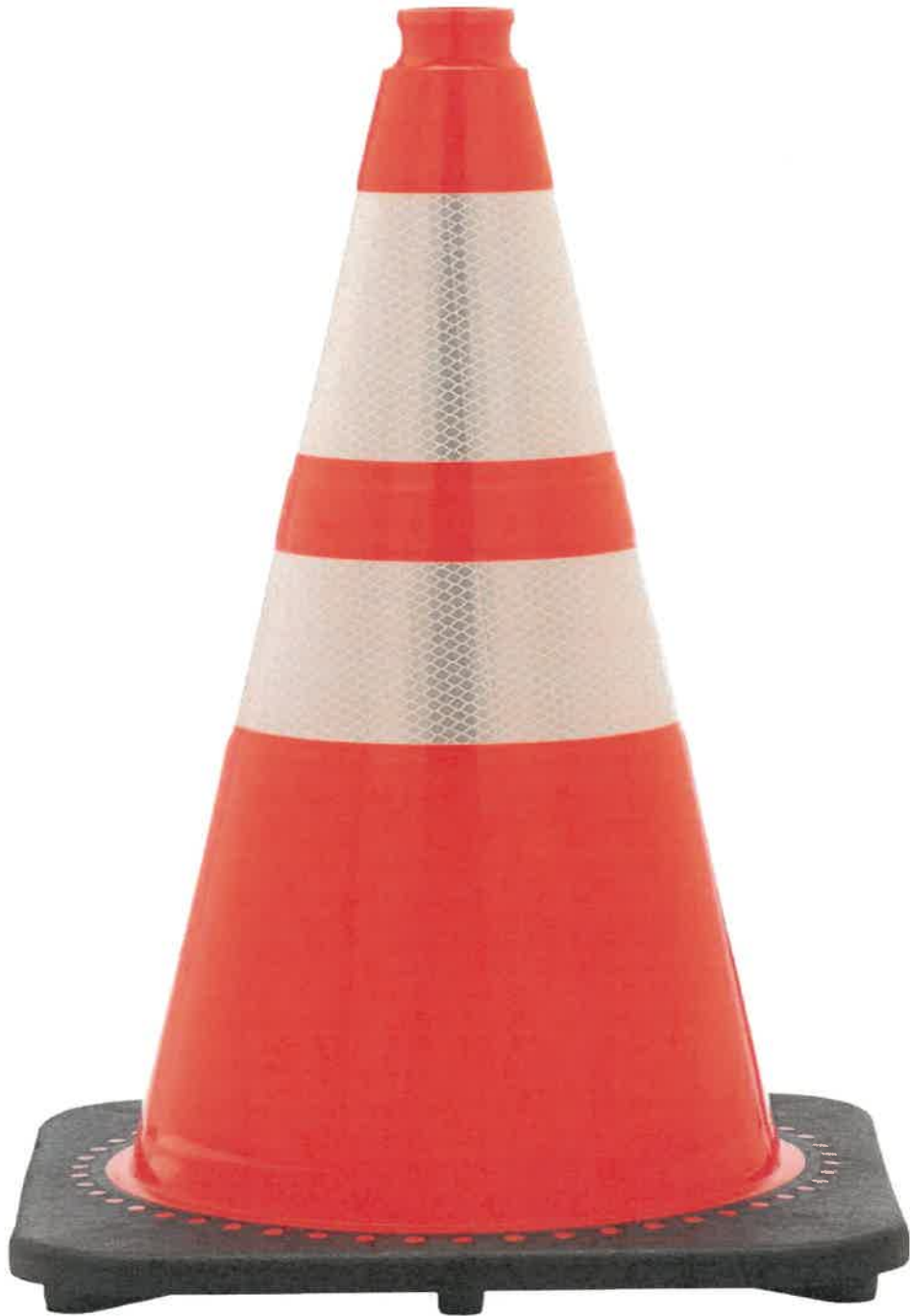
Reflective cone – orange (750 mm)