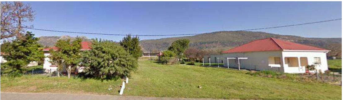
Figure 8: Site Photos of the 5 Houses