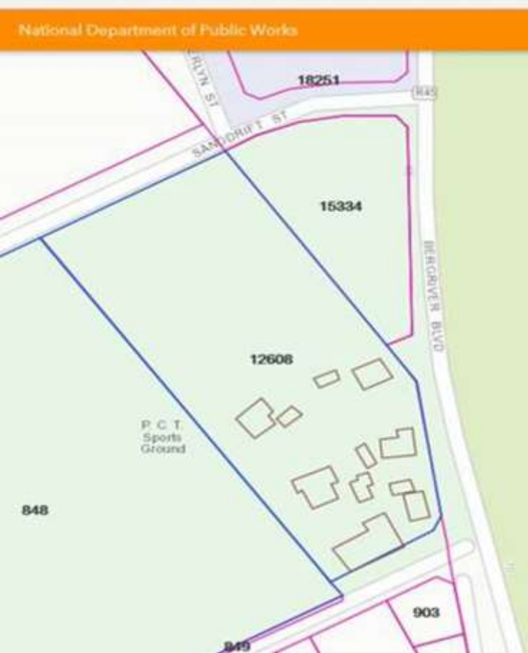
Figure 10: Site Map of the 5 Houses