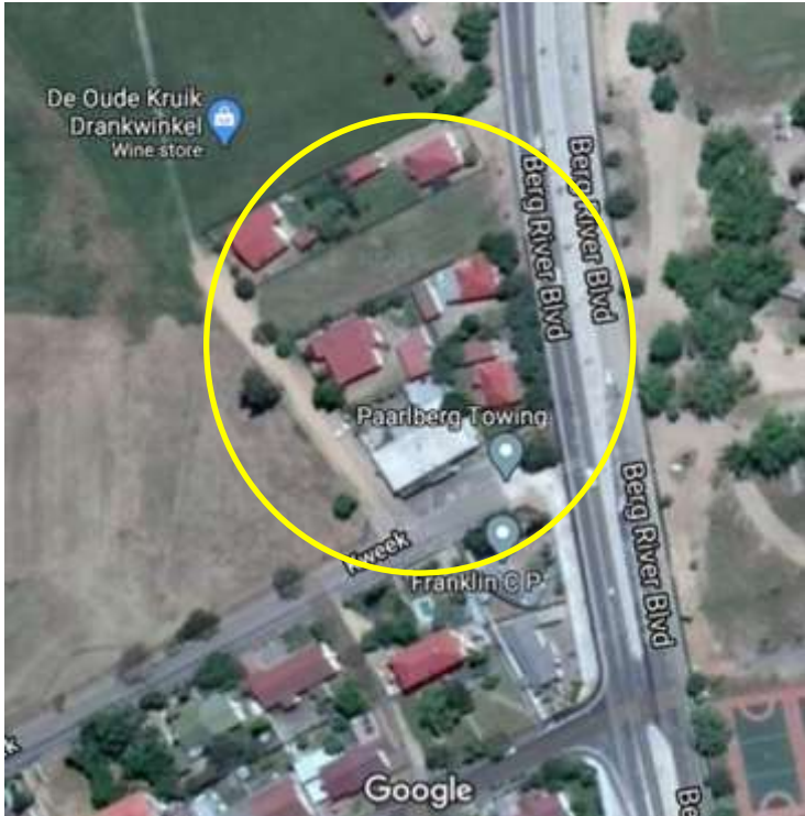
Figure 9: Aerial Photo of the 5 Houses