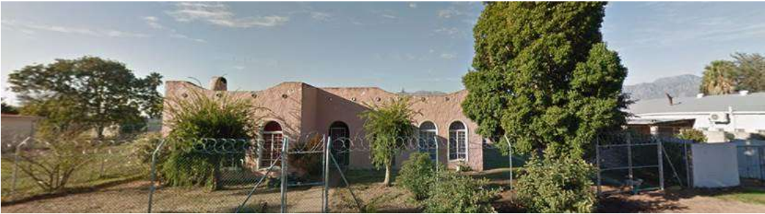
Figure 6: Site Photos of the 5 Houses