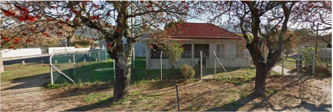
Figure 7: Site Photos of the 5 Houses