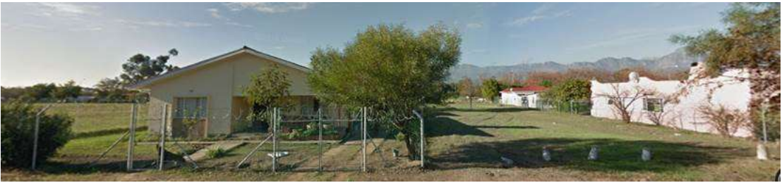
Figure 5: Site Photos of the 5 Houses