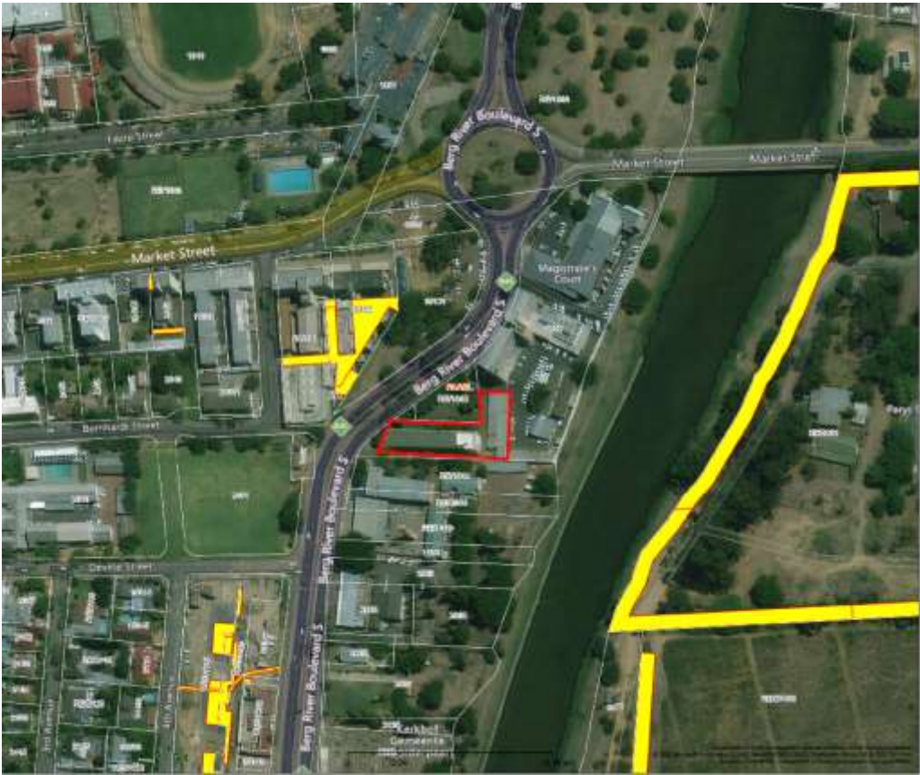
Figure 1_15 Flats in Paarl on Bergriver Blvd (red section)