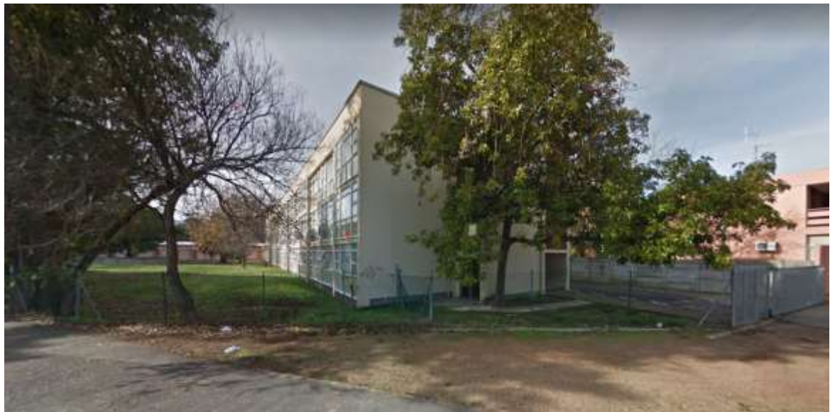
Figure 3: Site Photo of the 15 Flats