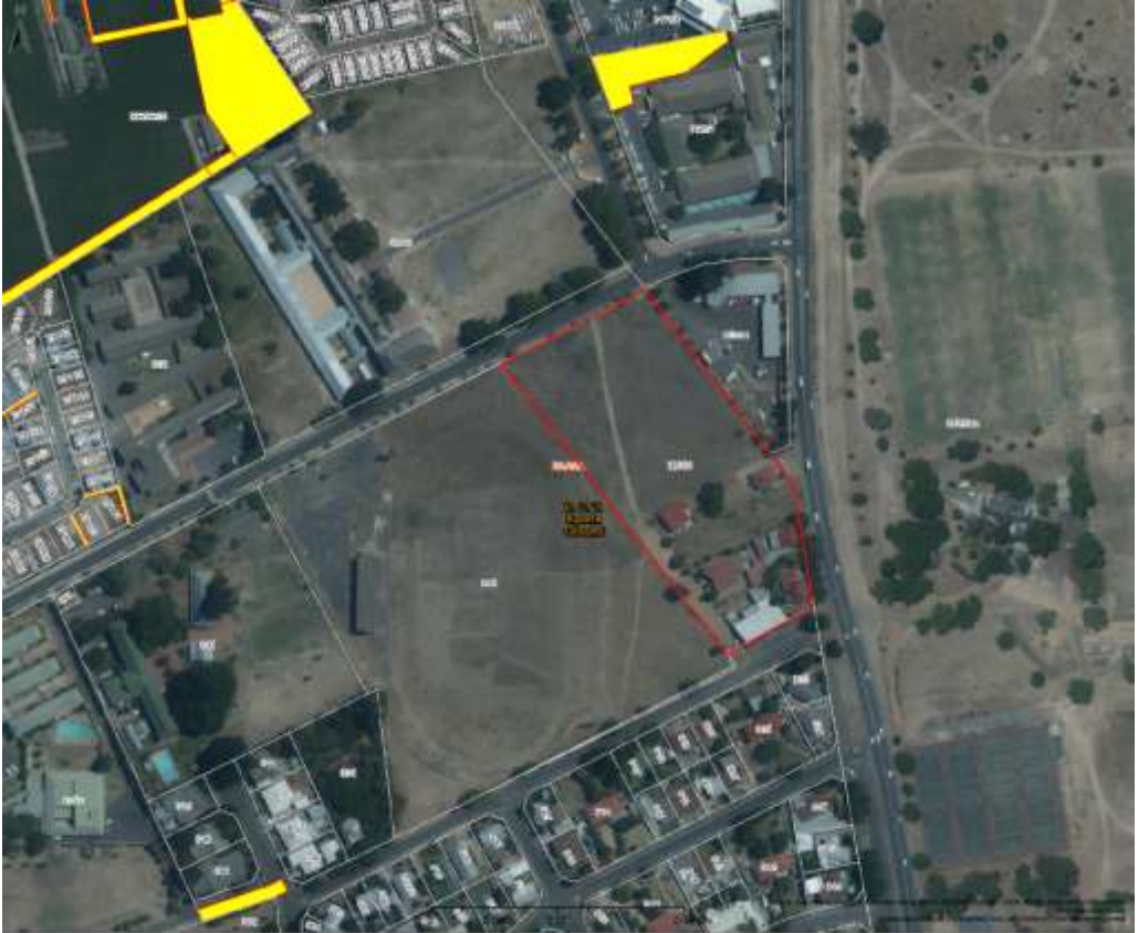
Figure 2_5 Houses in Paarl on Bergriver Blvd (red section)