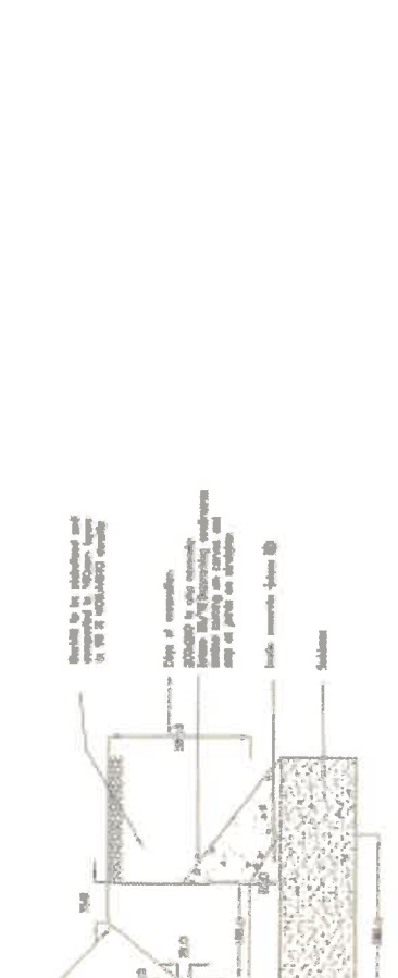
DETAIL OF BARRIER KERB (FIG. 2)