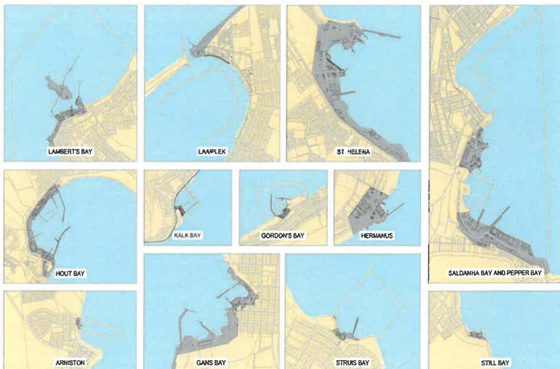
Fig 1: The locations of the 13 Proclaimed Fishing Harbours

As part of the initiatives identified by role players, initiative 4B is related to Environmental Protection of Small Harbours Developments within South Africa . A detailed action plan has been developed through engagement processes, but due to resource shortages, a basic in-house process was initiated with assistance of the Operation Phakisa: Chemicals and Waste Economy Programme.