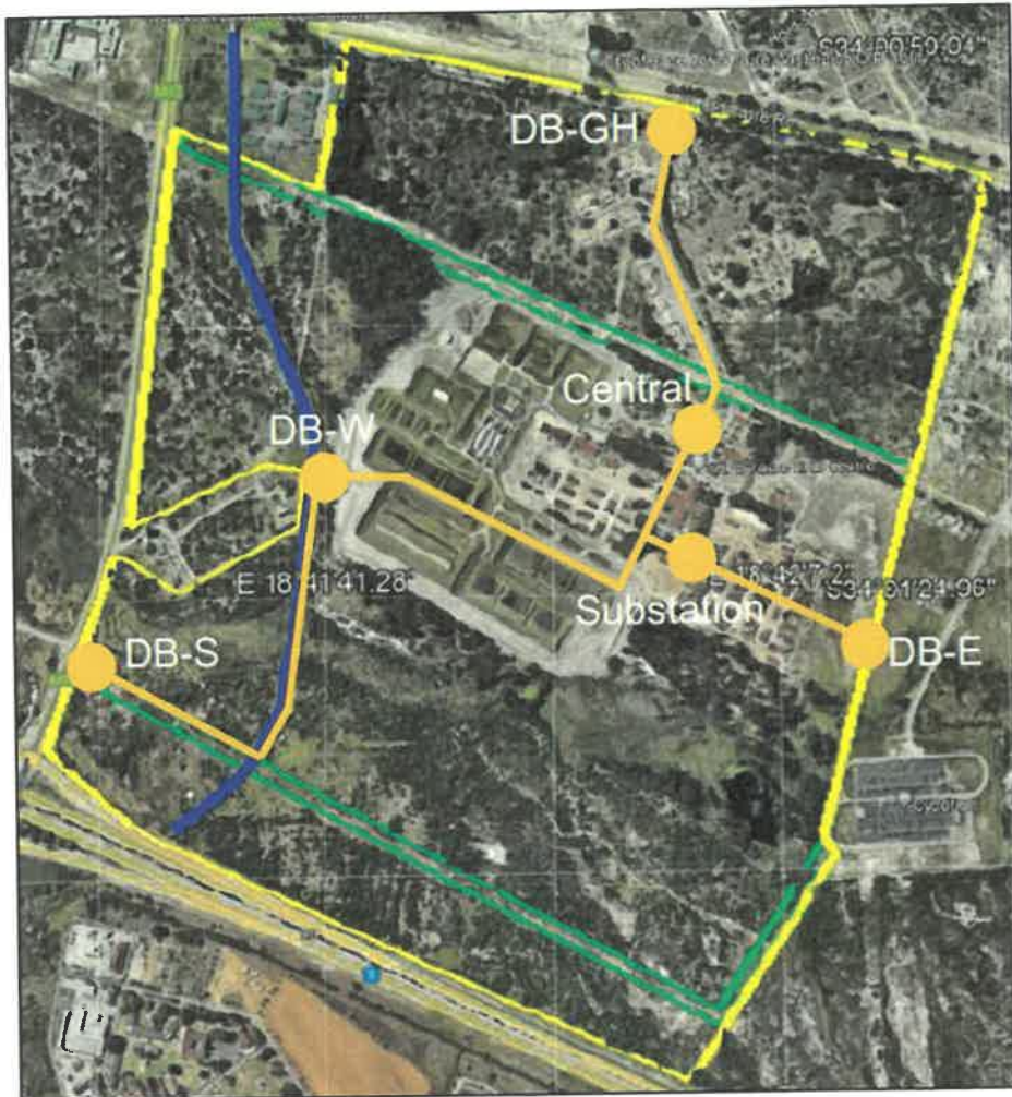
Proposed new wall layout with site underground sleeved electrical reticulation layout