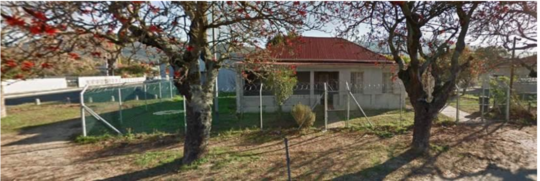
Figure 7: Site Photos of the 5 Houses