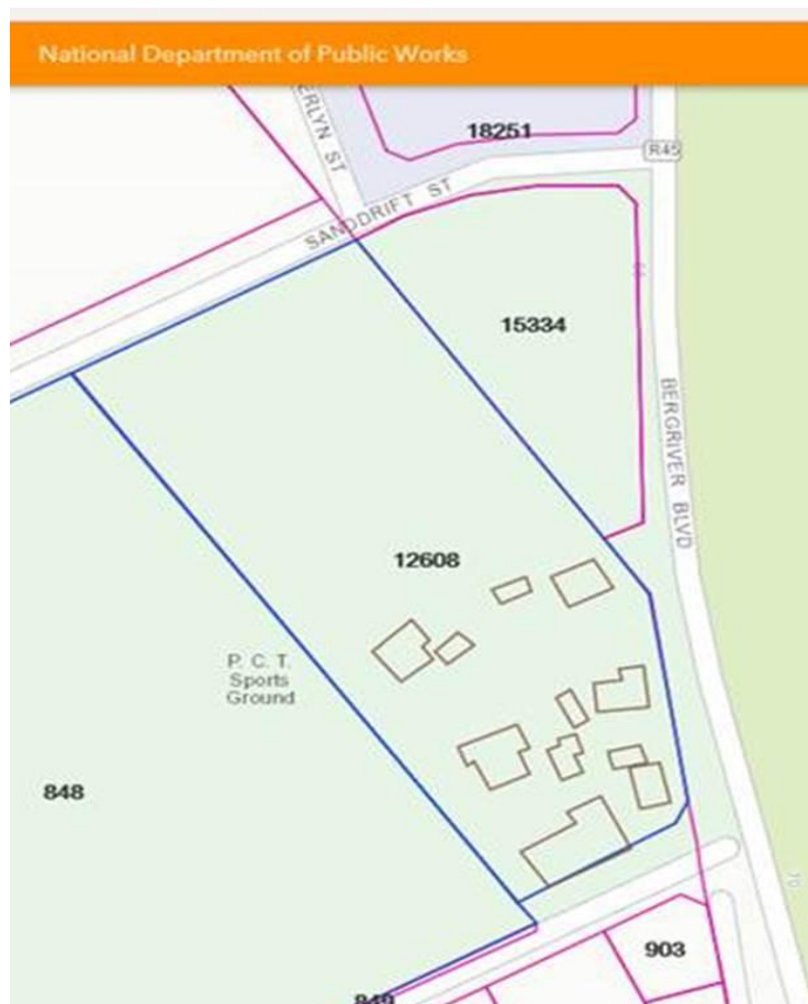
Figure 10: Site Map of the 5 Houses