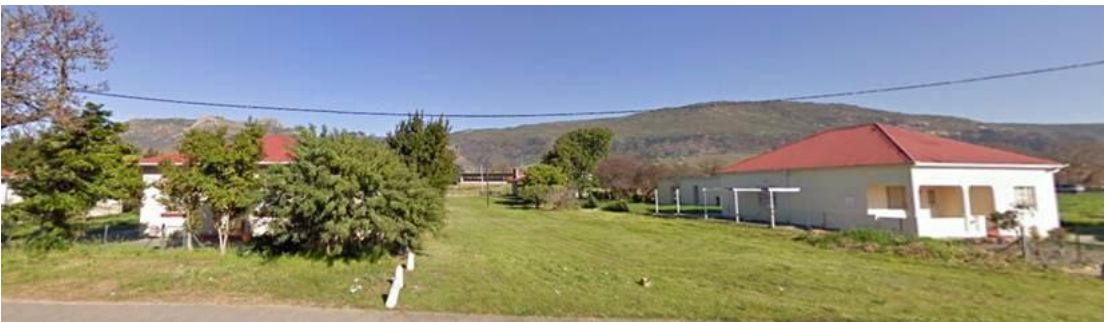
Figure 8: Site Photos of the 5 Houses