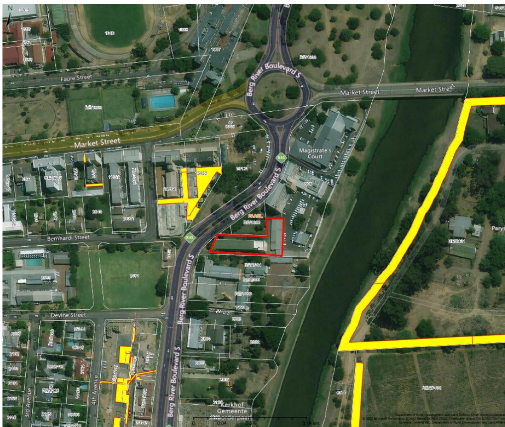
Figure 1_15 Flats in Paarl on Bergriver Blvd (red section)

The 15 Flats are located in Paarl next to the Paarl Police Station on Bergriver Boulevard and the 5 Houses are located next to Erf 12608 on Bergriver Boulevard, Paarl.