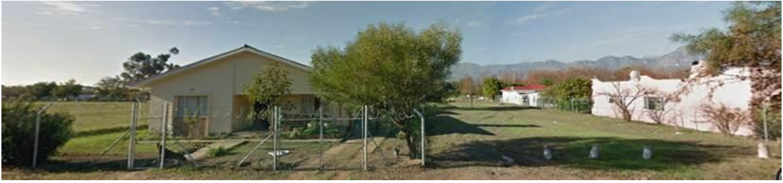
Figure 5: Site Photos of the 5 Houses