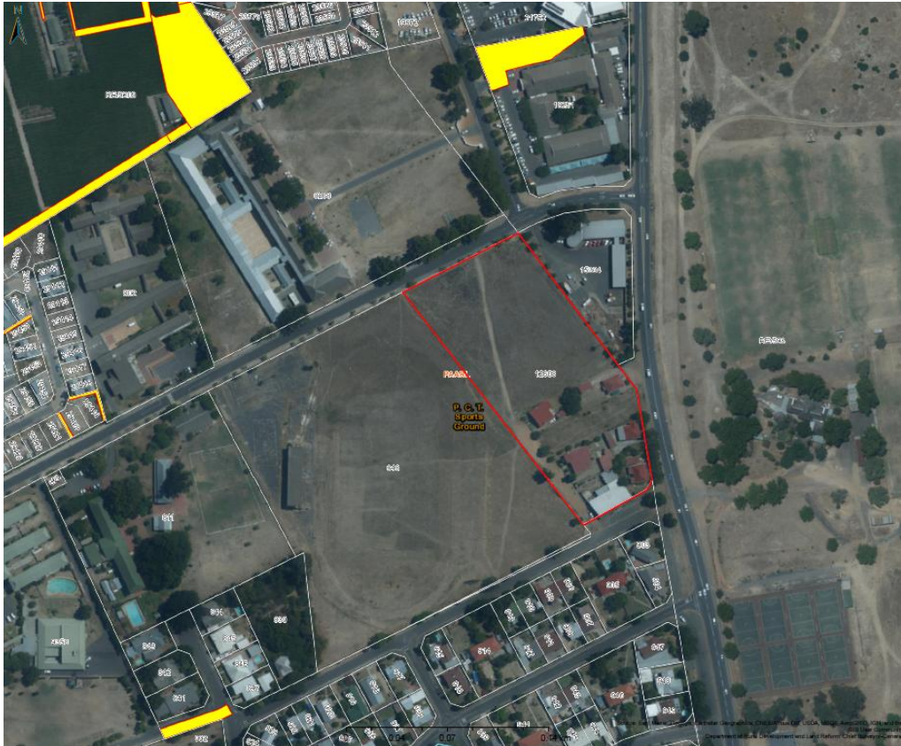
Figure 2_5 Houses in Paarl on Bergriver Blvd (red section)

The project estimate is contained in the specific professional discipline activity schedule and used in the normal fee calculation as per this appointment