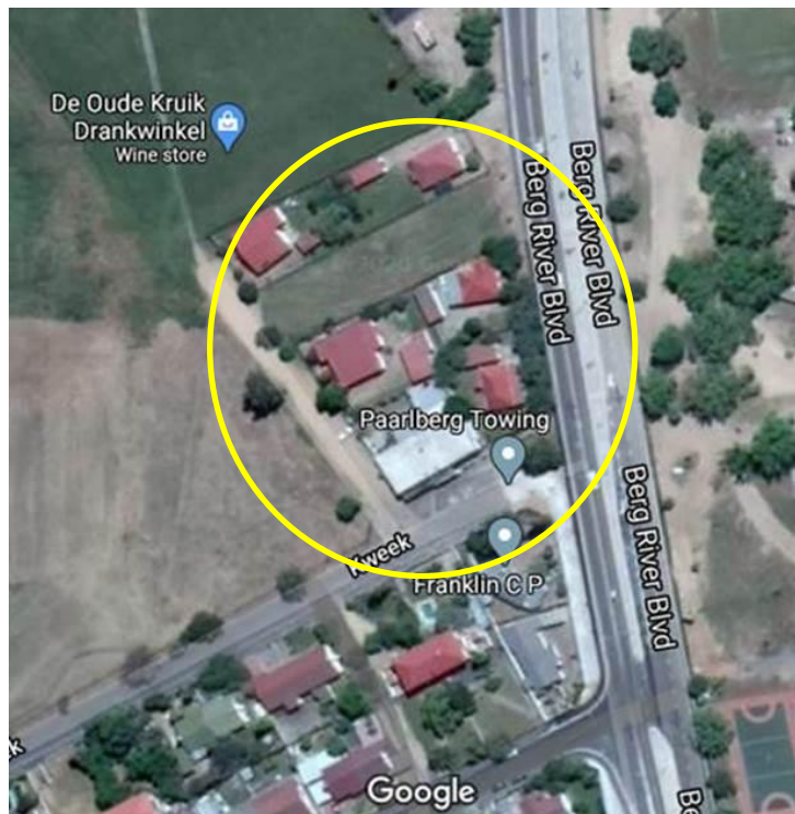
Figure 9: Aerial Photo of the 5 Houses