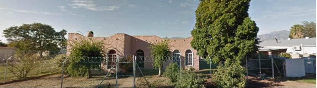
Figure 6: Site Photos of the 5 Houses