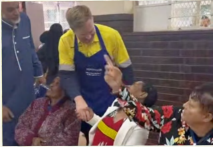
Community Iftar with residents in Fietas, Johannesburg.

Around the same time, we also saw visible progress on major infrastructure projects, including the Johannesburg Deeds Office development. This project stands as a powerful example of what the Department is capable of delivering when professionalism, planning and execution are aligned. It also signals renewed confidence in the revitalisation of our urban centres.