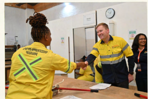
Visit to the Expanded Public Works Programme's National Youth Service.

This is the future of the EPWP. It must be more than a temporary work opportunity. It must become a pathway to permanent employment, entrepreneurship and long-term economic participation. The work underway to reform the programme is aimed at achieving exactly this outcome.