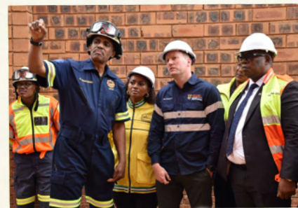
Visit to the tragic building collapse site in Ormonde.