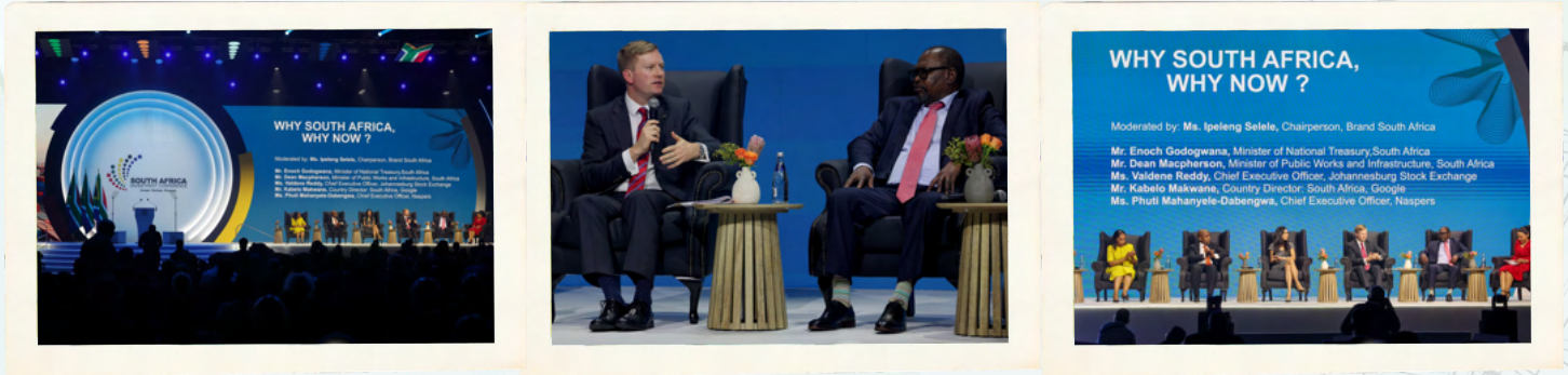
Attending the South African Investment Conference in Sandton.

The month concluded with strong momentum on the investment front, where infrastructure once again took centre stage as a driver of economic growth. Through the work of Infrastructure South Africa, we continue to remove regulatory bottlenecks, accelerate project preparation and unlock investment into the country. This is critical as we work to ensure more shovels in the ground and more cranes in the sky.