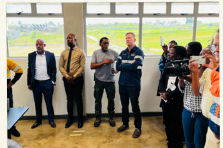
Visit to the Fresh Produce Market in Mbombela.