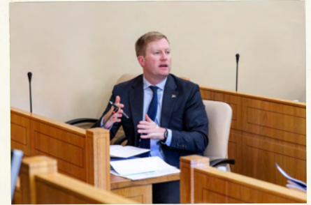
Briefing to Parliament on progress with the Department's legislative reform programme.

During this period, we also briefed the Portfolio Committee on Public Works & Infrastructure on progress with the Department's legislative reform programme. Key pieces of legislation currently under development will play an important role in improving infrastructure delivery, strengthening oversight, and ensuring greater accountability within the built environment. At the same time, work is advancing to modernise the legislative framework governing state property as we prepare for the establishment of the South African National Property Company.