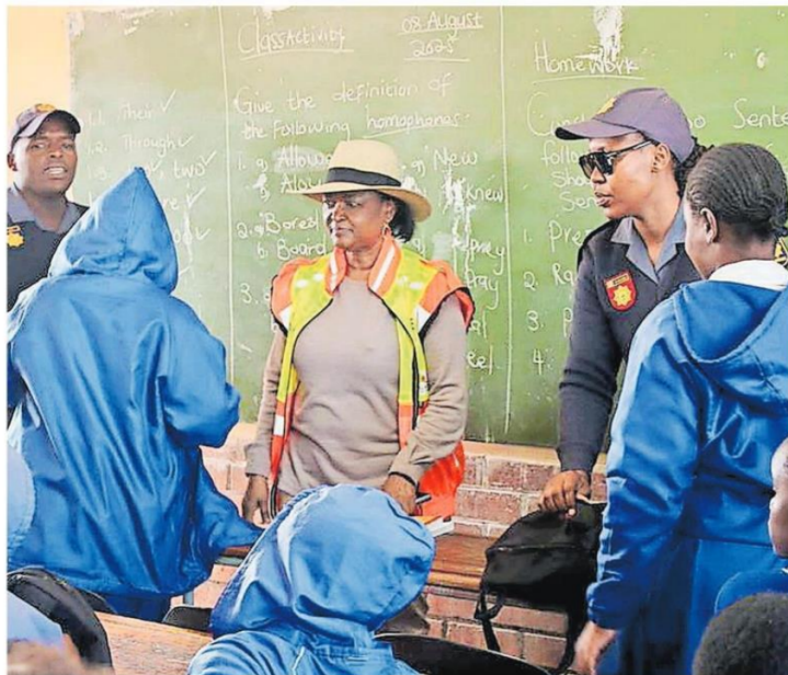
SAPS officers at Masitakhe Secondary School.