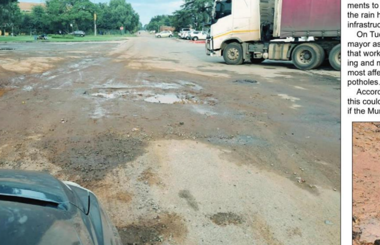
Huge potholes formed in Stilfontein roads after heavy traffic from the N12 was diverted through the town because of flooding

Mayor Mahlope pleaded with residents to be patient, saying the city is fully committed to addressing and resolving the various challenges and disruptions that have arisen as a result of the heavy rainfall.