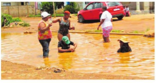
To highlight their frustration, residents swam in a giant pothole in the