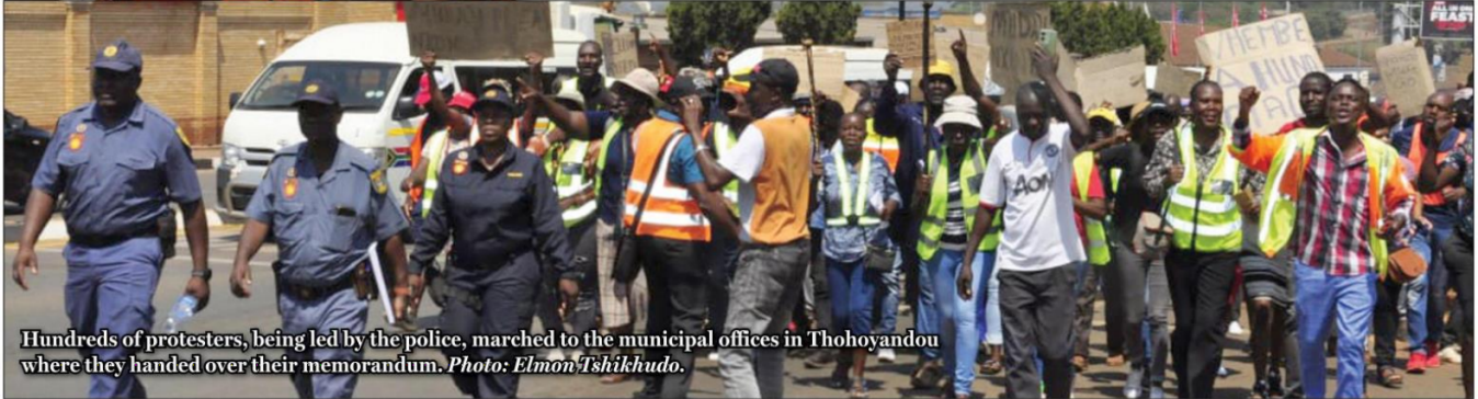
Hundreds of protesters, being led by the police, marched to the municipal offices in Thohoyandou where they handed over their memorandum.