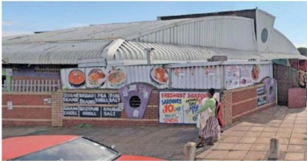
THE Phoenix Millennium Market.

RIGHT: A file photo from 2018.