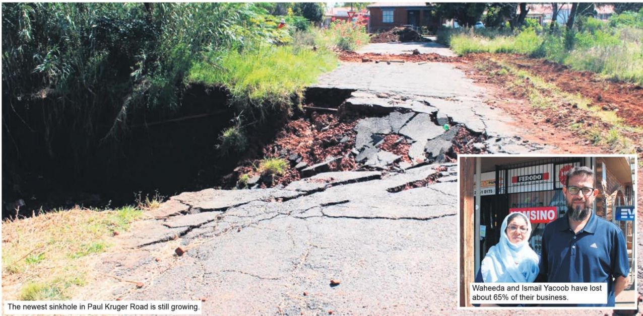
The newest sinkhole in Paul Kruger Road is still growing.

Reach: 59929 AVE: R 76376.26 Author: Shaun Sproule