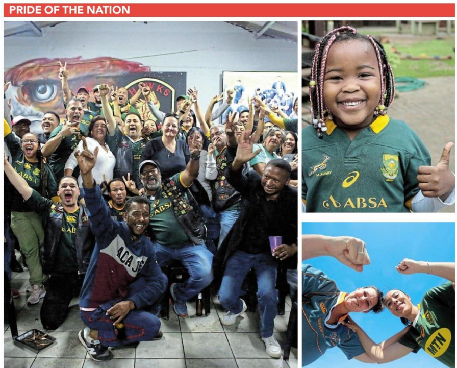
Springbok supporters in their green and gold rugby shirts across the city on Bok Friday.