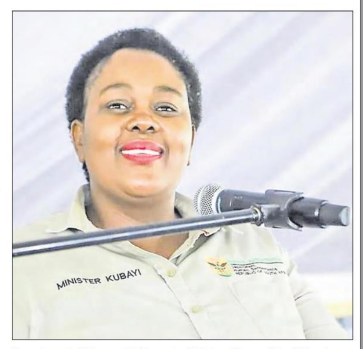
Department of Human Settlements Minister, Mmamoloko Kubayi.

Of the 360 units, 20 were handed over. The relocation will be done in batches of 20 families as the municipality will have to demolish the 20 structures of each of the 20 batches of relocated families at the transit camp.