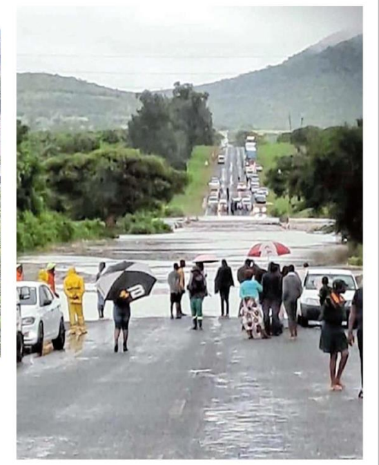
Workers and pupils were left stranded after water flooded a bridge to town in Nkomazi.

Cooperative governance and traditional affairs spokesper-