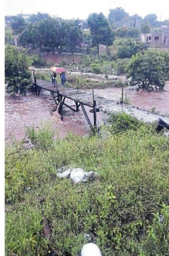
Pupils cross a rickety makeshift bridge to school in the Nkomazi area

The bridge was built by the community with wood, mud and wires some time ago out of desperation.