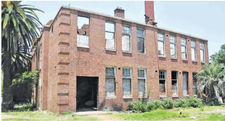
SKELETON. Now condemned, Martin School in Boksburg is home to many who have nowhere else to go.