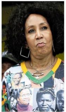
Lindiwe Sisulu reportedly 'left the chamber after the debate.'