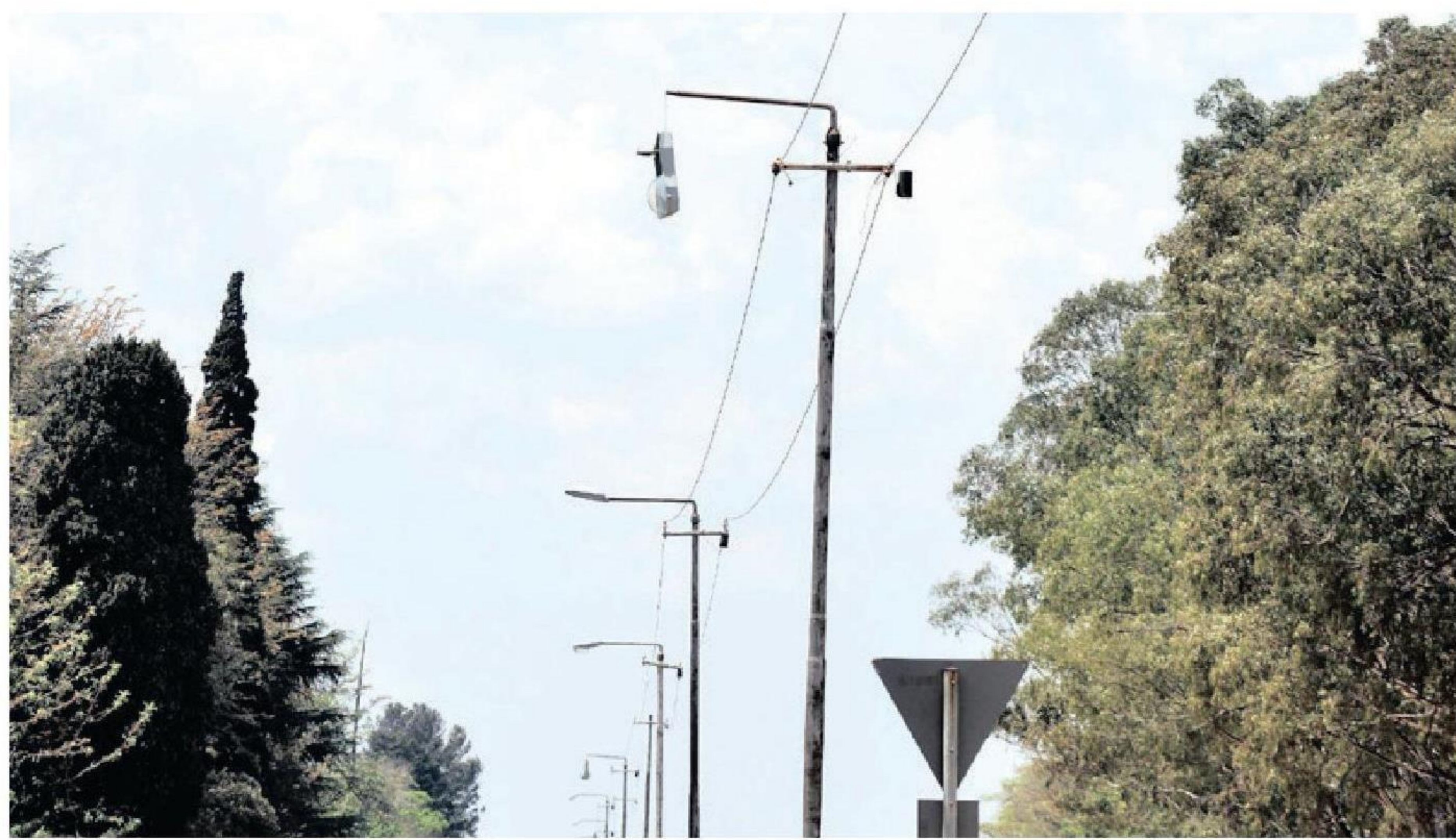
BROKEN street lights are evidence of a Thaba Tshwane in desperate need of maintenance.