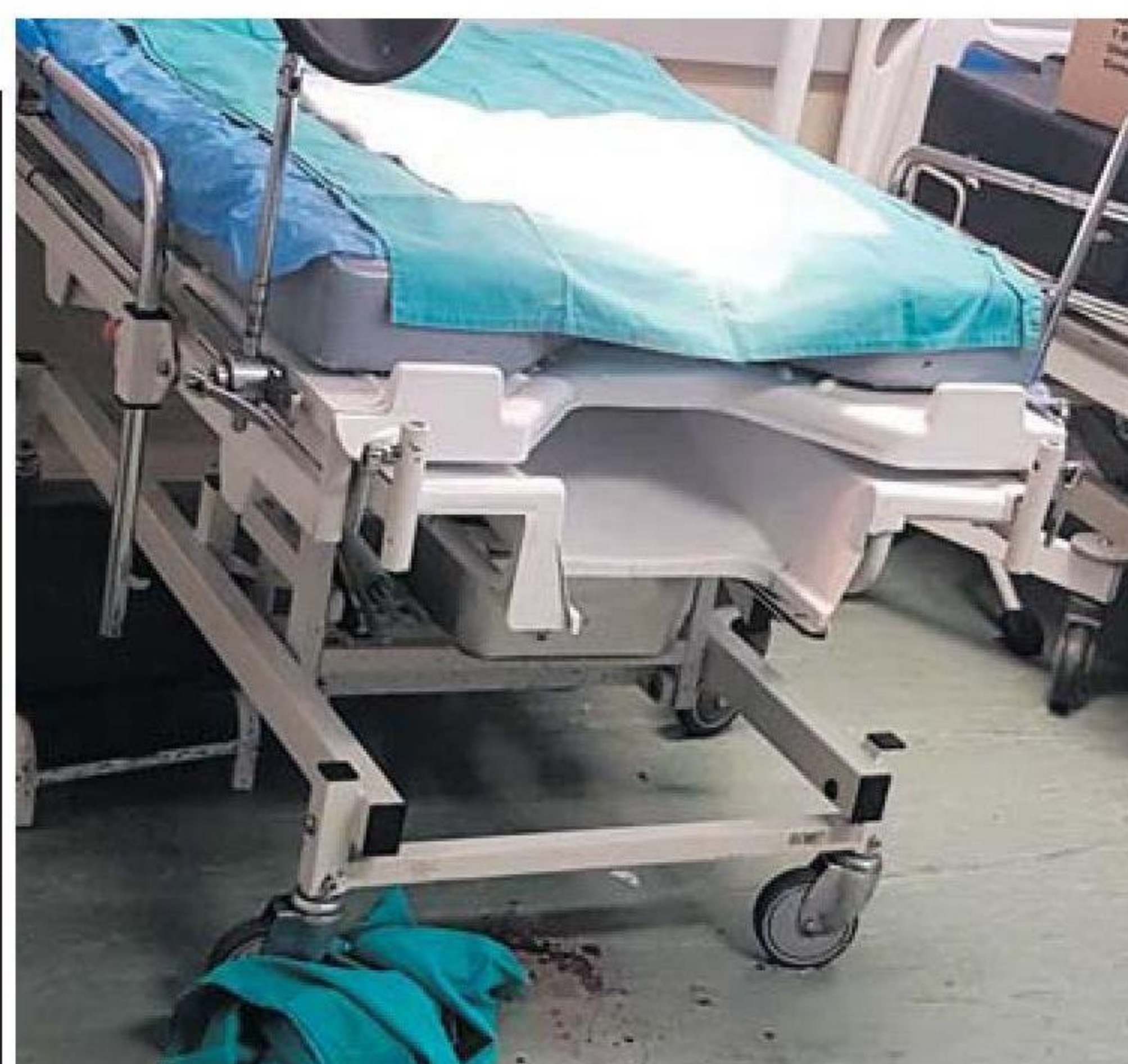
Blood and scrubs can be seen on the floor in a ward in Ermelo Provincial Hospital.

"The manager of maintenance was engaged during an executive meeting to begin to conduct daily rounds."