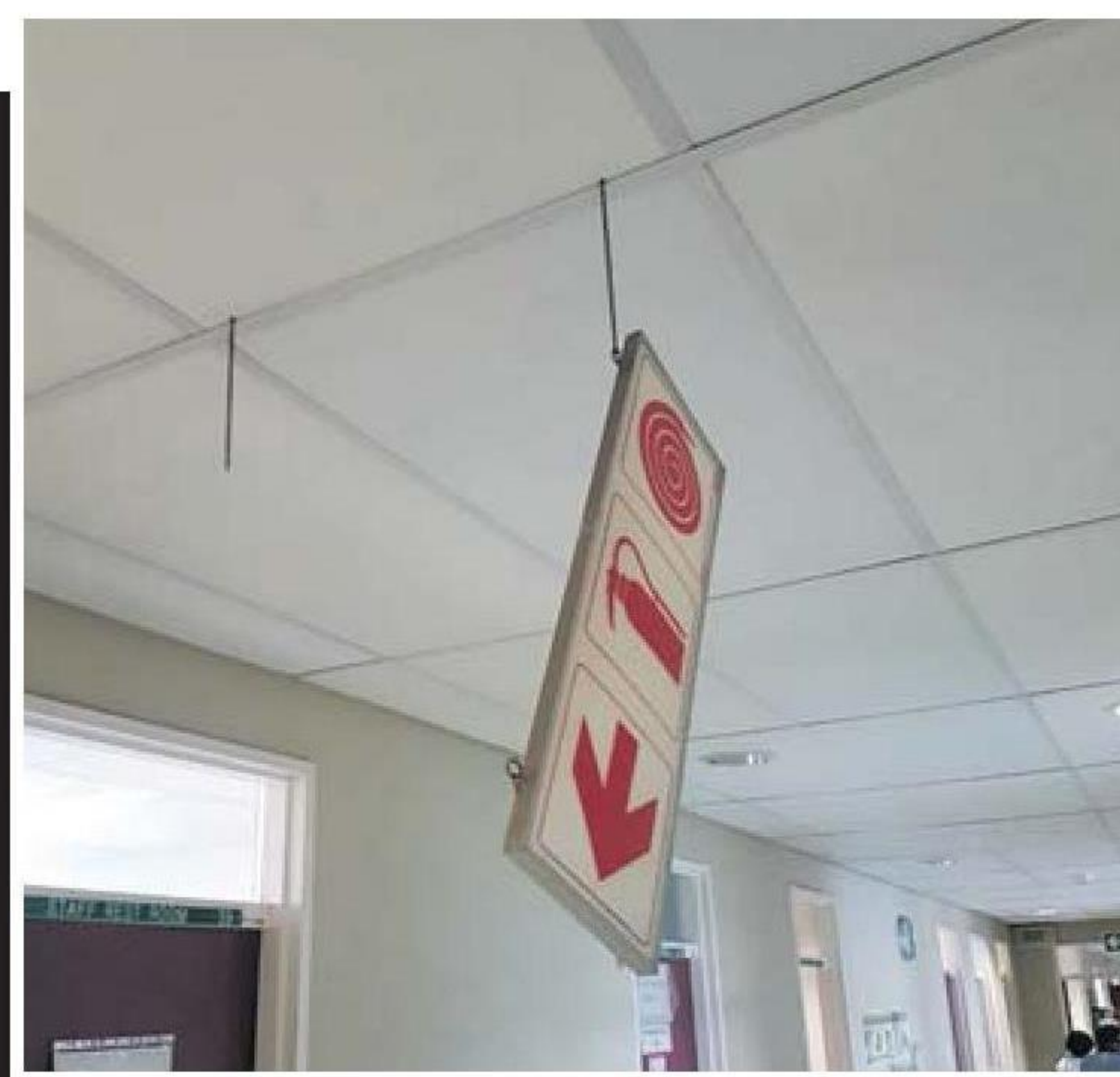
An emergency sign dangles from the roof at Ermelo Provincial Hospital.