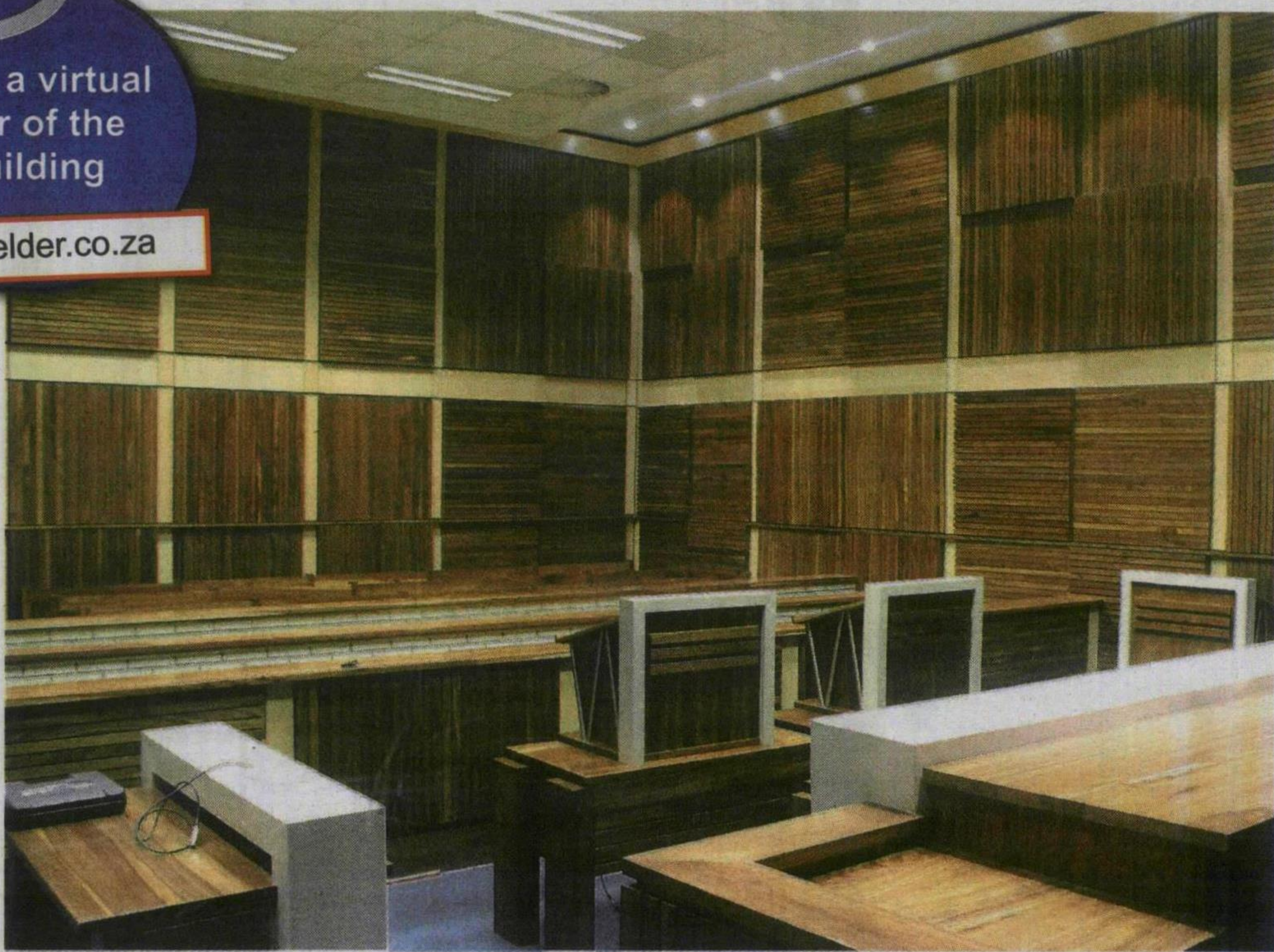
Inside one of the courtrooms.