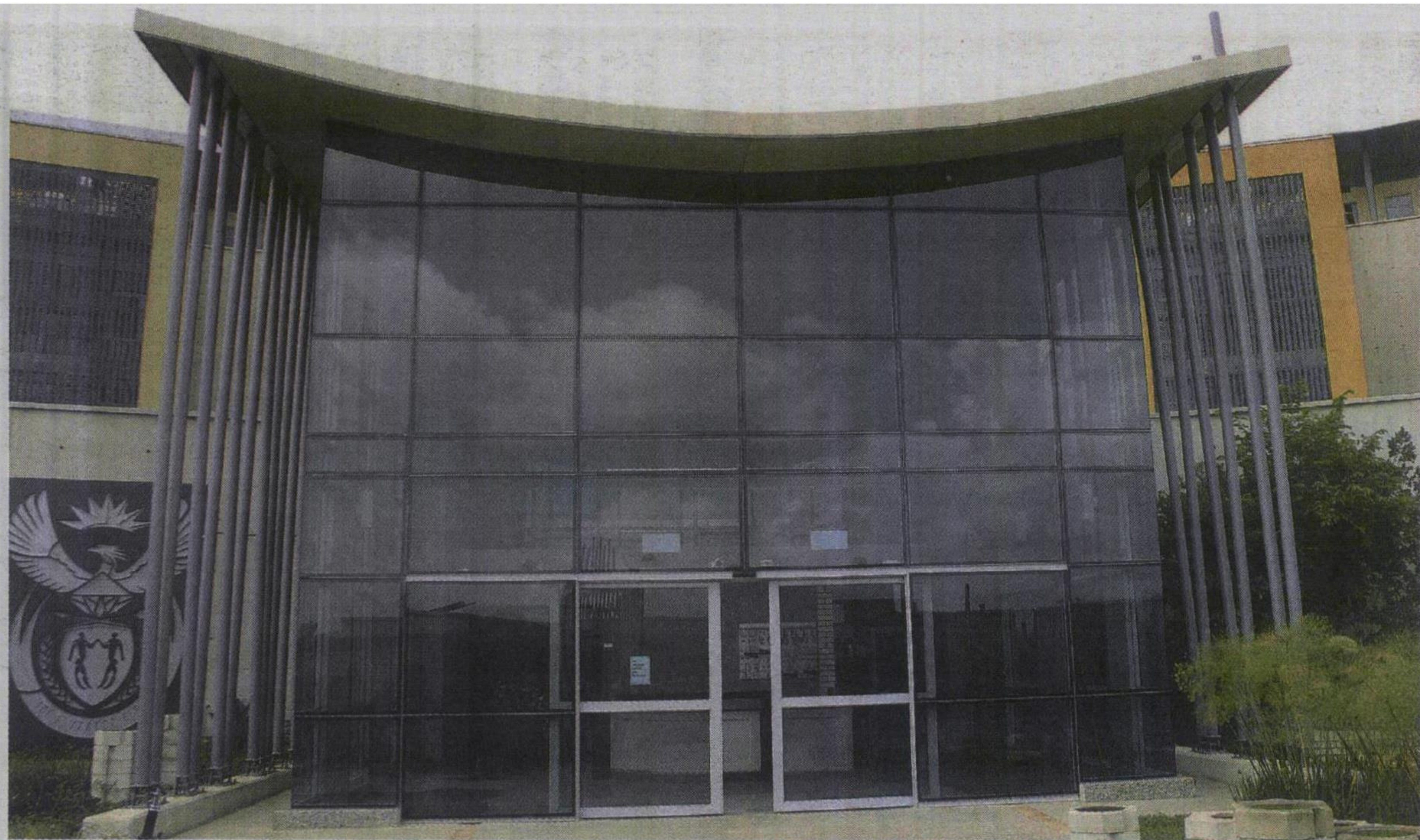
The entrance to the Mpumalanga High Court building.