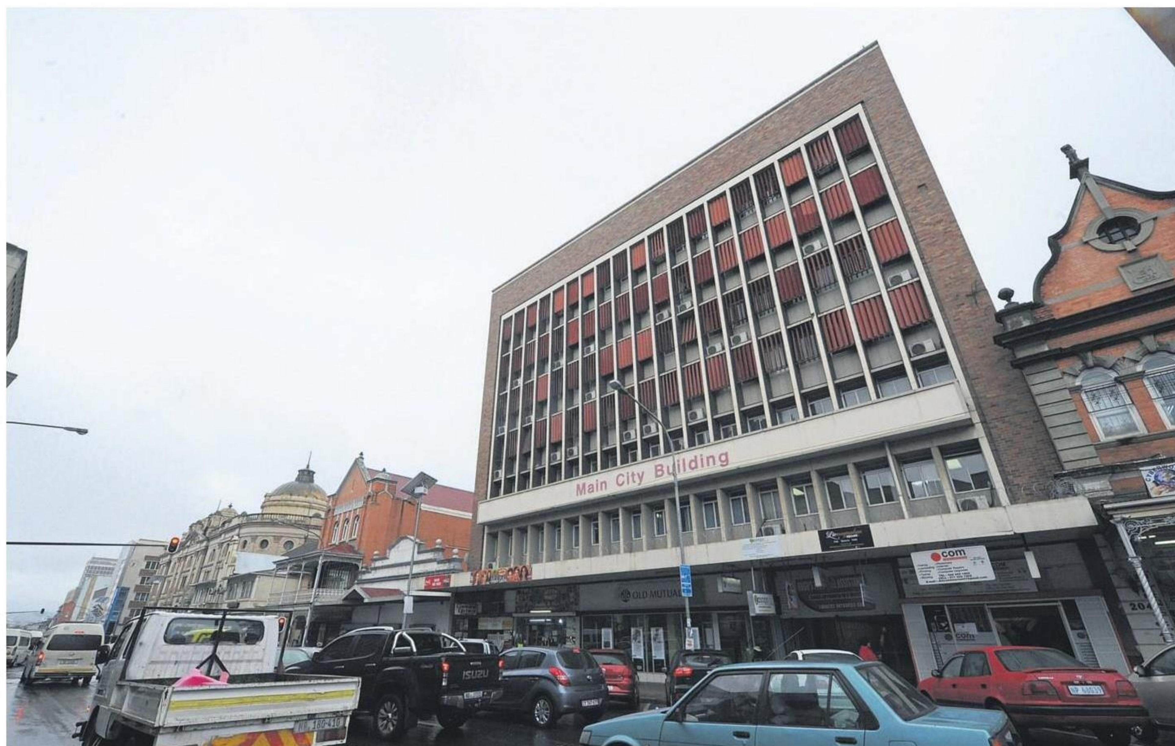
The VIP Unit is stationed at the Main City Building on Langalibalele Street.