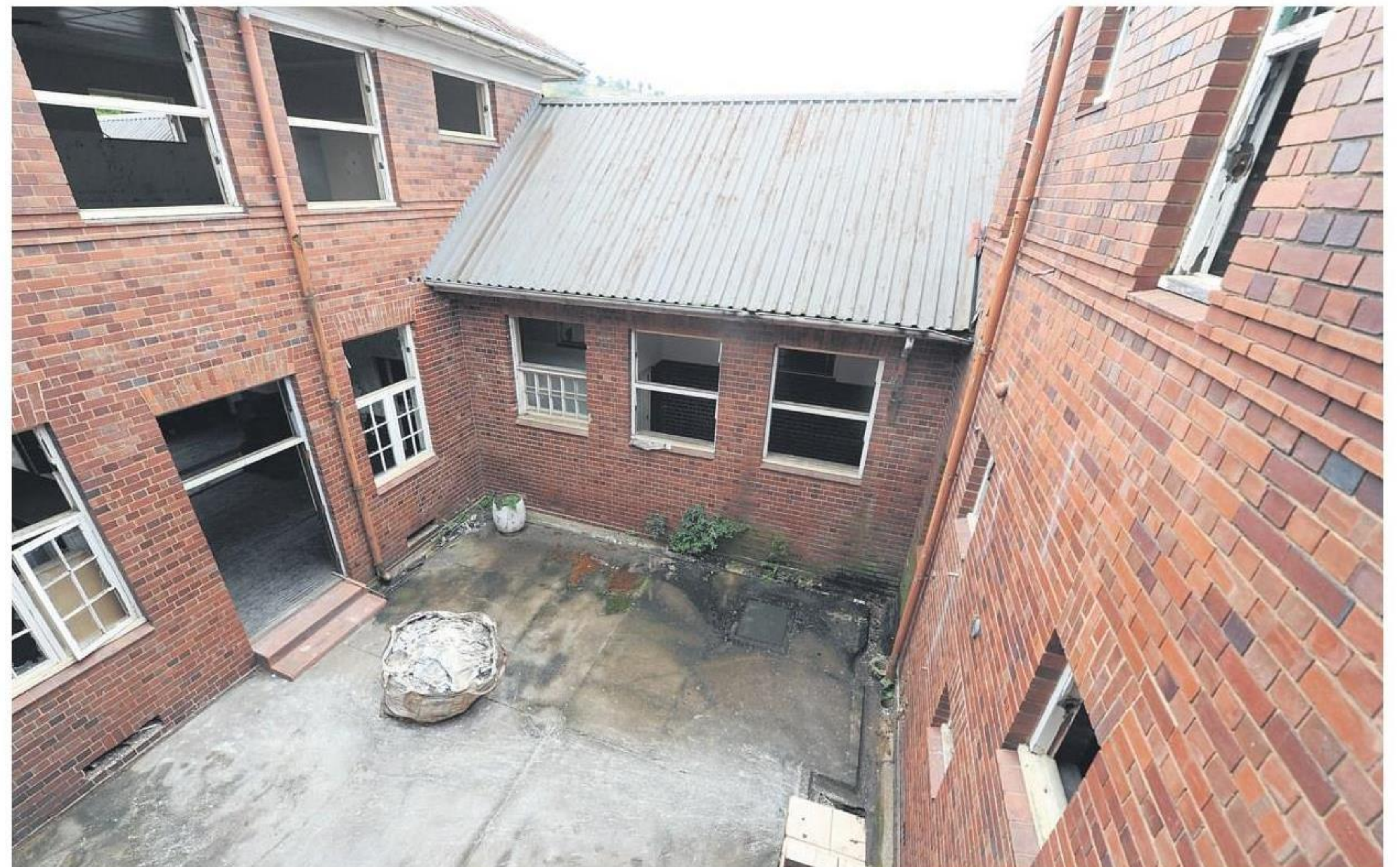
A bird's eye view of the court yard, sporting a single bag, filled to the brim with rubbish.