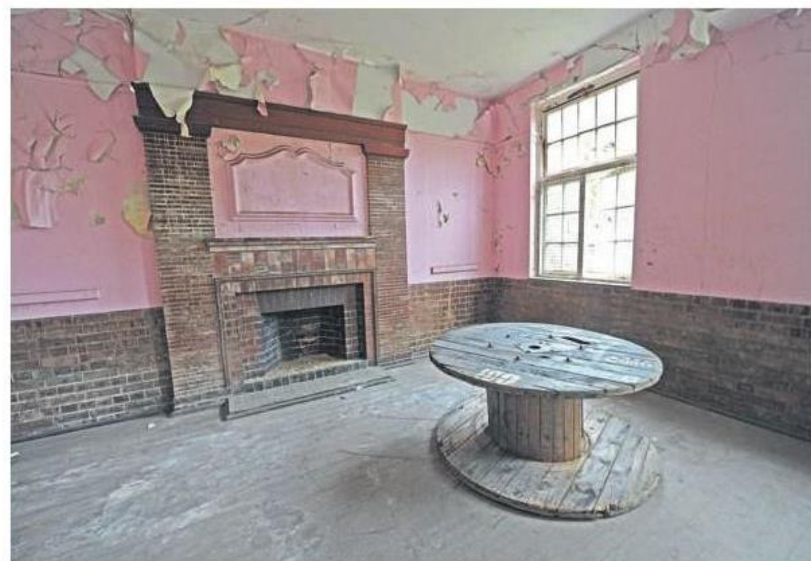
ABOVE: A dilapidated room in the vacant building. LEFT: Ronaldo Fourie said holes were made in the ceiling and floors of the vacant building by vagrants so they could steal pipes and wiring.