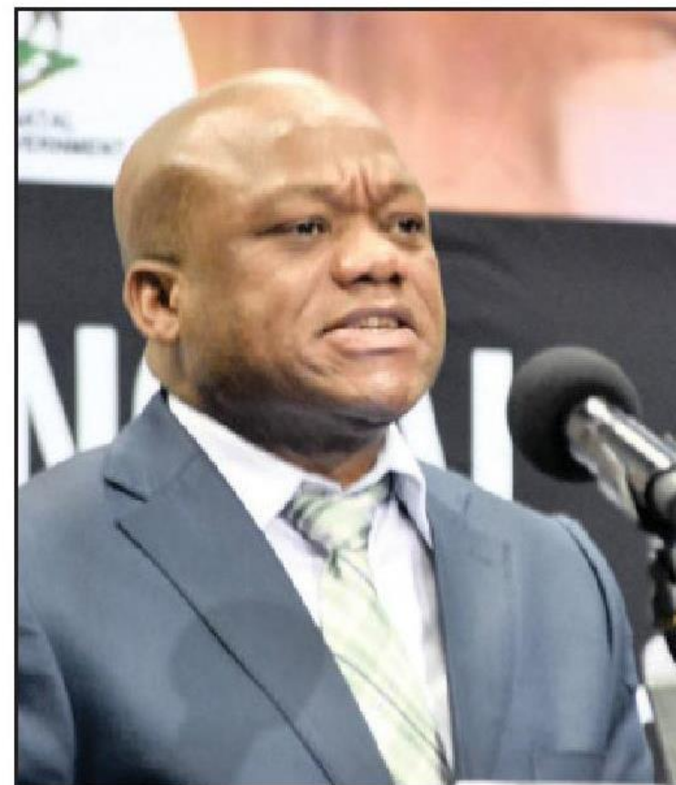
Acting KZN premier and MEC for Economic Development and Tourism, Sihle Zikalala.