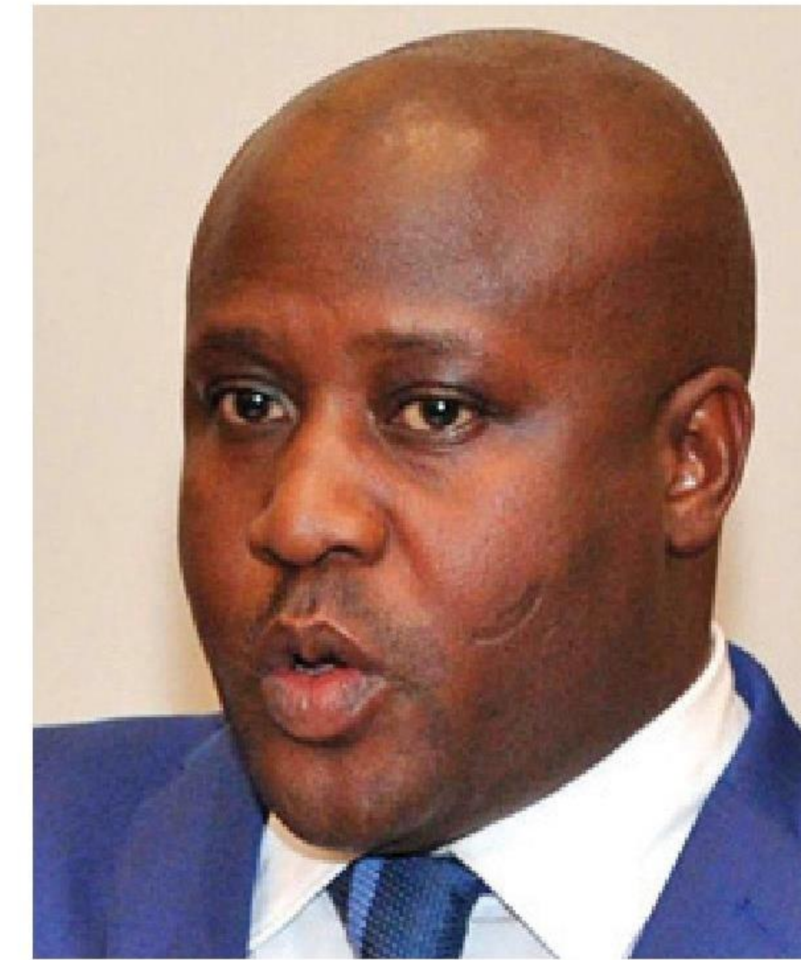
State Security minister Bongani Bongo.