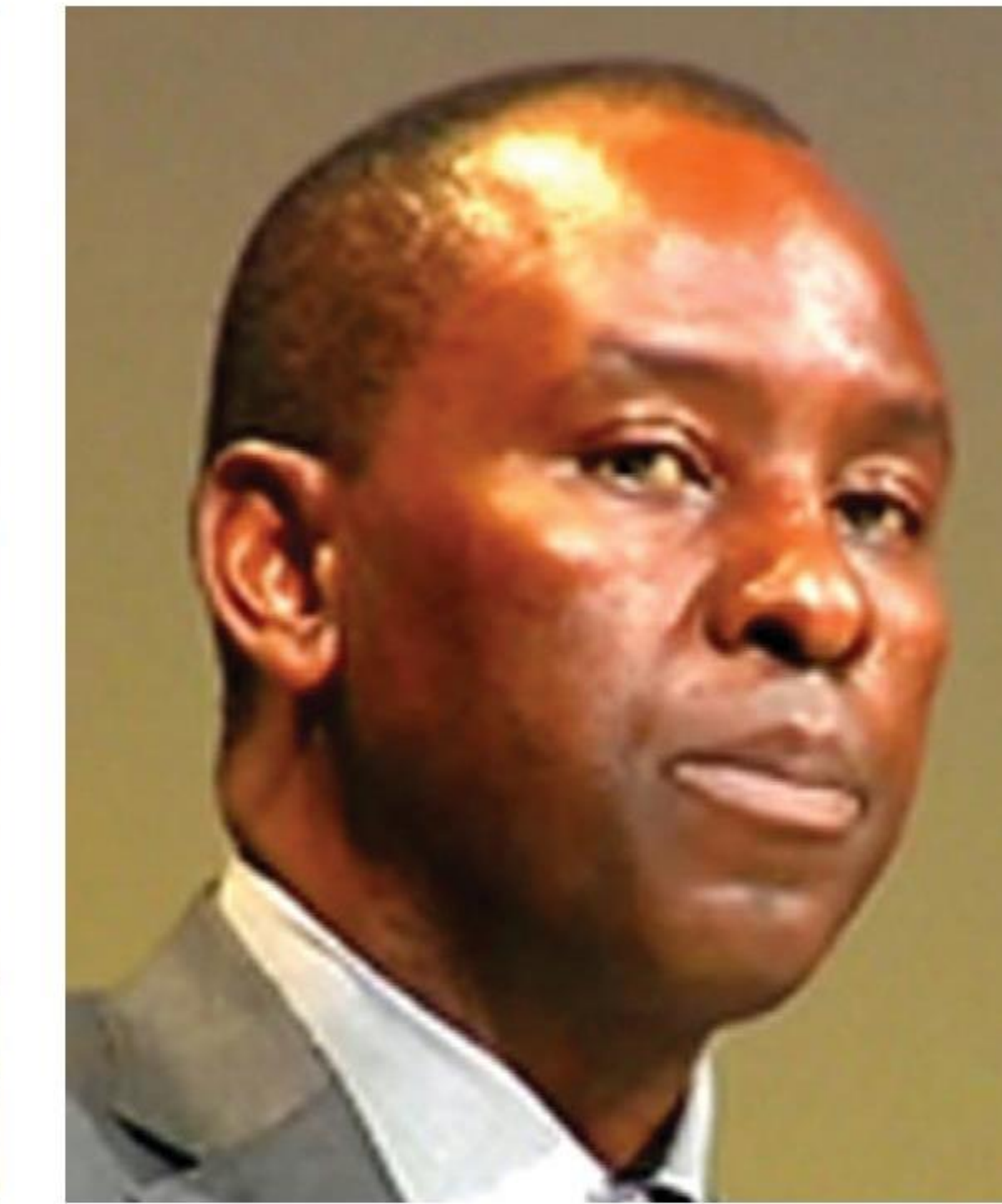
Mining minister Mosebenzi Zwane.