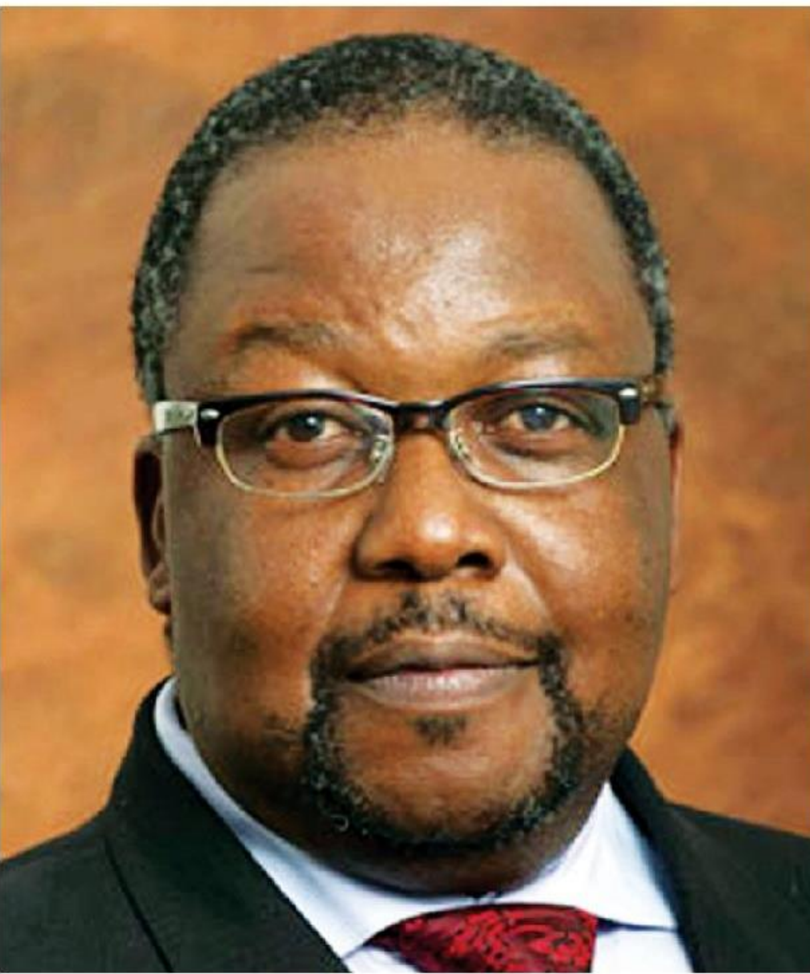
Public Works minister Nathi Nhleko.