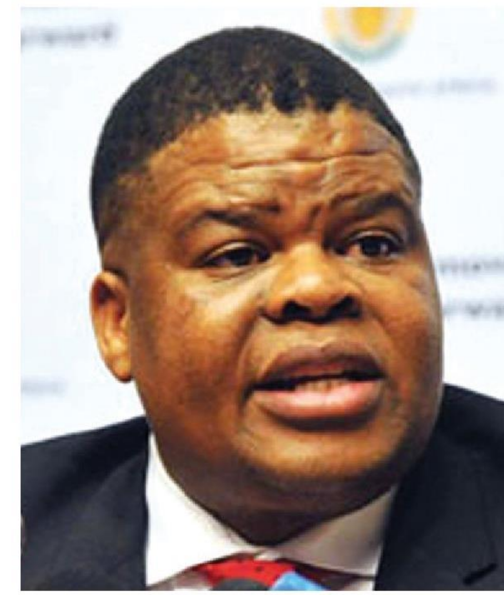
Energy minister David Mahlobo.