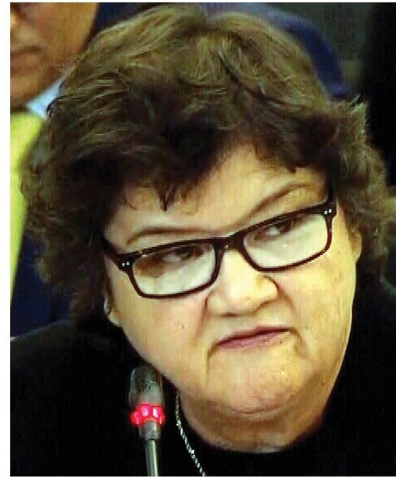
Former minister Lynn Brown.