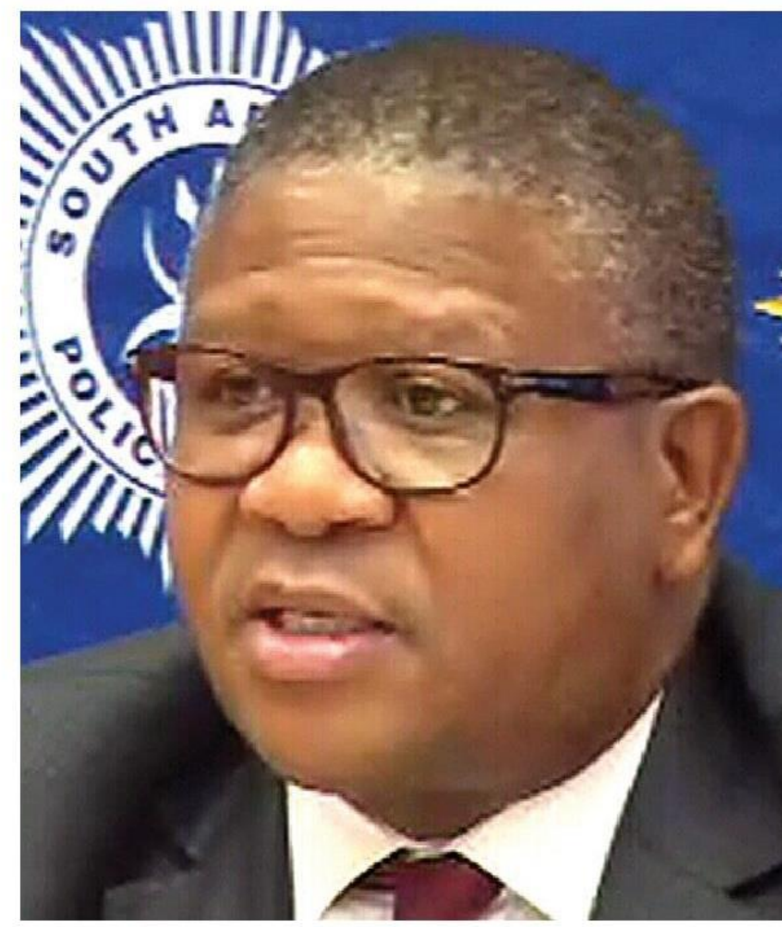
Police minister Fikile Mbalula.