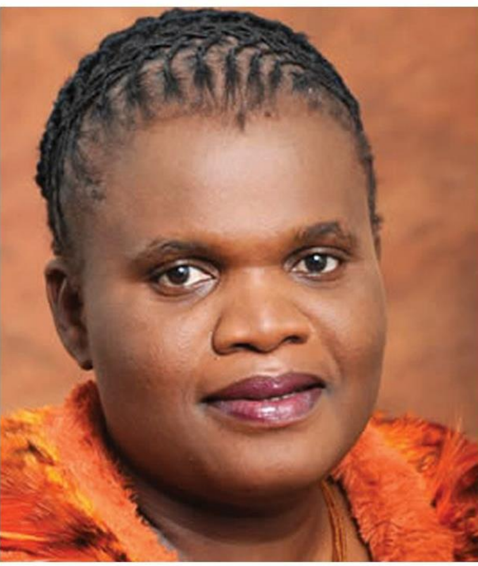
Public Service minister Faith Muthambi.