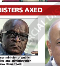
Former minister of public service and administration Ngoako Ramathodi