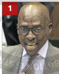
Minister of Finance: Malusi Gigaba

This morning Gordhan and Jonas joined protesters who had