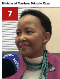
Minister of Tourism: Tokozile Xasa