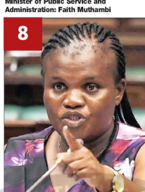
Minister of Public Service and Administration: Faith Muthambi