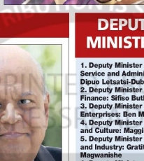
Former finance minister Pravin Gordhan.