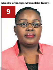
Minister of Energy: Mmamoloko Kubayi