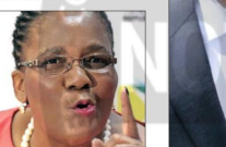
Former minister of transport, Dipuo Peters