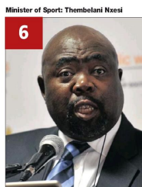
Minister of Sport: Thembelani Nxele