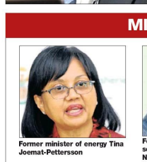
Former minister of energy Tina Joemat-Pettersson