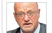
Former minister of tourism Derek Hanekom