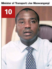
Minister of Transport: Joe Maswanganyi