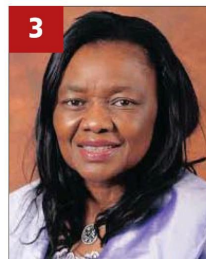
Minister of Home Affairs: Hengiwe Mkhize