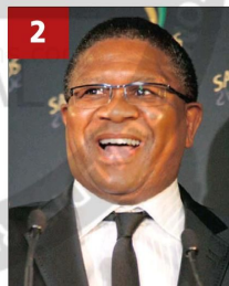
Minister of Police: Fikile Mbalula