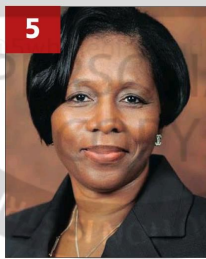
Minister of Communications: Ayanda Dlodlo