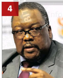
Minister of Public Works: Nathi Nhleko