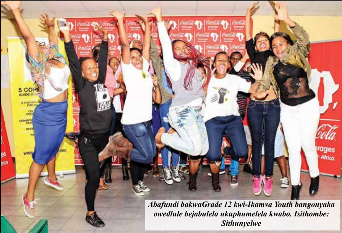
Abafundi bakwaGrade 12 kwi-Ikamva Youth bangonyaka owdlule bejabulela ukuphumelela kwabo.