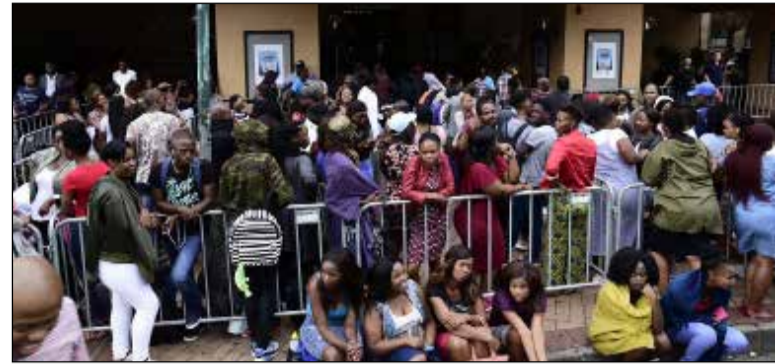
Bekugwele kanje ngaphandle kwabebelinde ukuyongena kwinhlolokhono yama-Idols SA Season 13 ePlayhouse eThekwini.