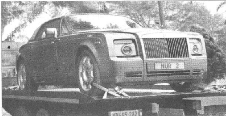
OFF TO AUCTIONEERS: One of the Rolls-Royce Phantoms seized.

The impounding of the cars yesterday, authorised by Pietermaritzburg High Court Acting