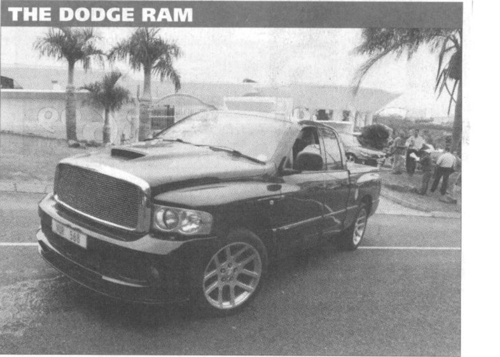
THE DODGE RAM