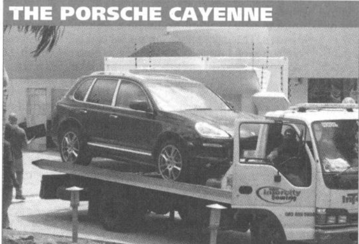
THE PORSCHE CAYENNE