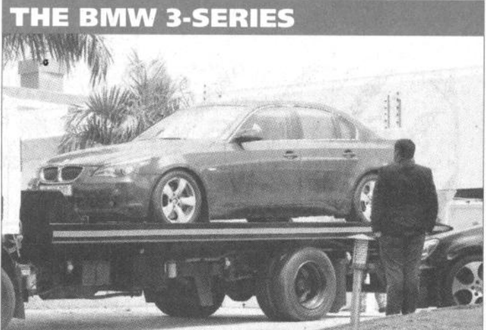
THE BMW 3-SERIES