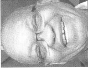
UNDER FIRE: Jacob Zuma