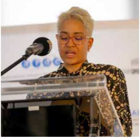
Gauteng MEC for Economic Development delivering the welcome address