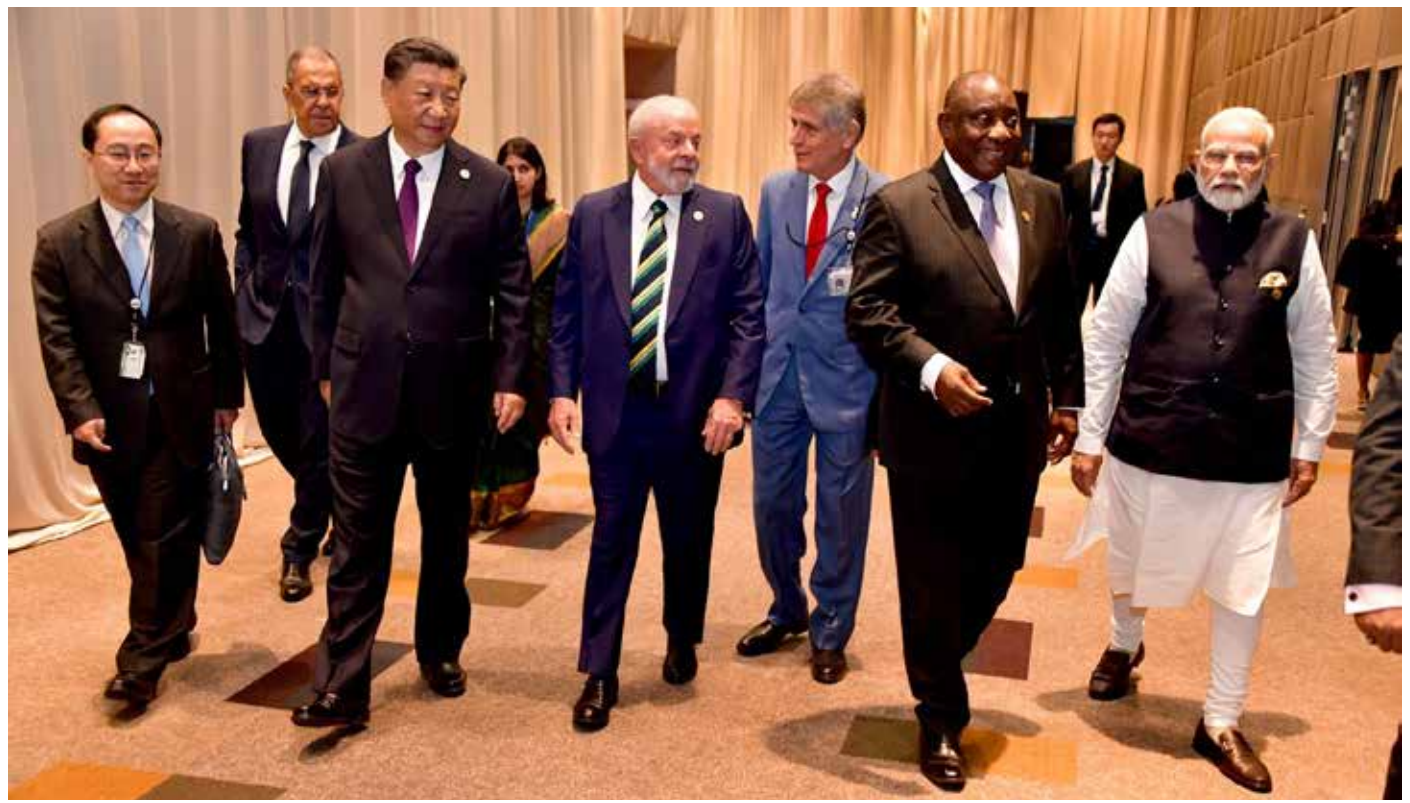
#BRICS #BRICSza www.brics2023.gov.za