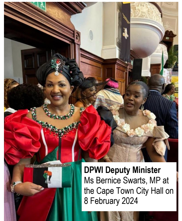
DPWI Deputy Minister Ms Bernice Swarts, MP at the Cape Town City Hall on 8 February 2024

Due to ongoing repairs of the National Assembly Chamber, the Cape Town City Hall will also be the venue for Finance Minister Enoch Godongwana's Budget Speech scheduled for later this month. As South Africa is approaching its General elections this year, there will be another SoNA after the elections.