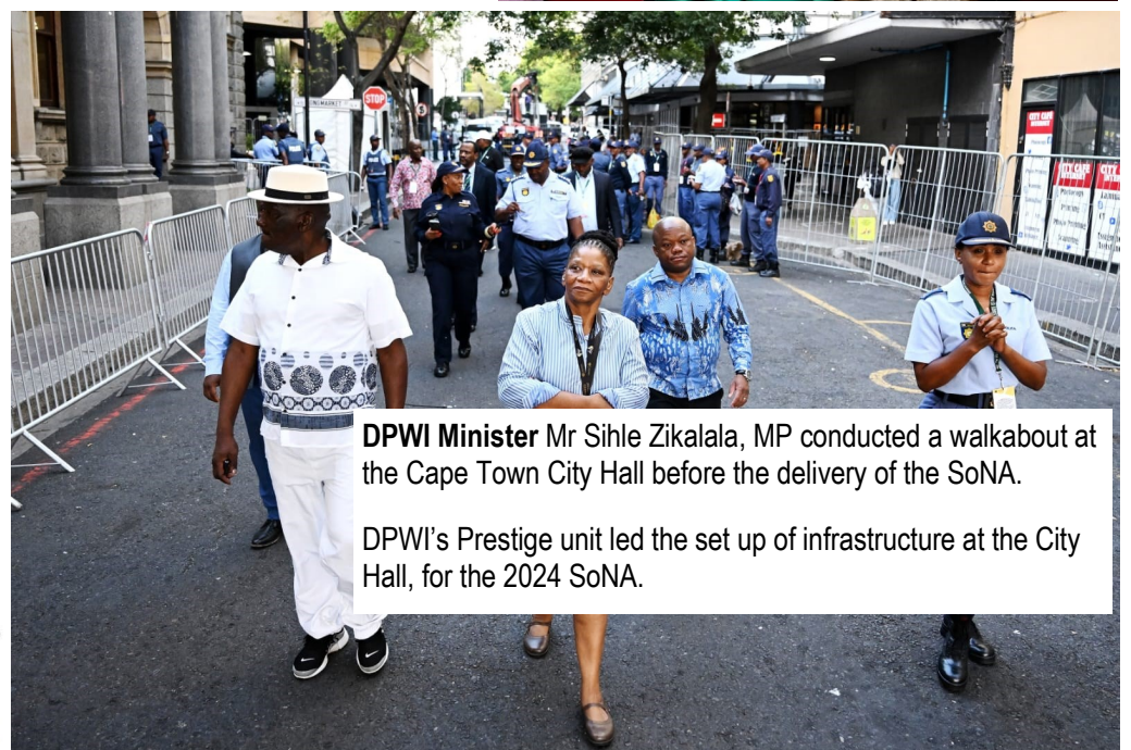
DPWI Minister Mr Sihle Zikalala, MP conducted a walkabout at the Cape Town City Hall before the delivery of the SoNA.