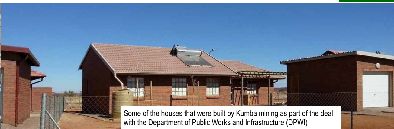
Some of the houses that were built by Kumba mining as part of the deal with the Department of Public Works and Infrastructure (DPWI)